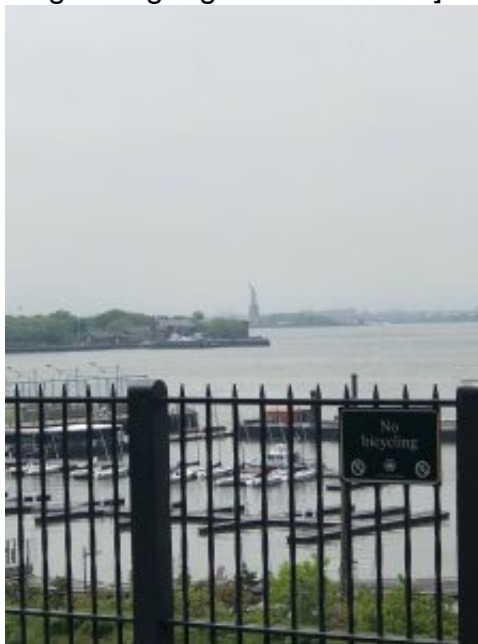
Lady Liberty from the promenade[/caption]

[caption id="attachment_5519" align="alignright" width="225"]