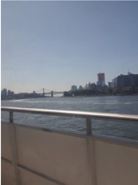
The East River Ferry view[/caption]