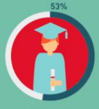
Job Offer by Graduation