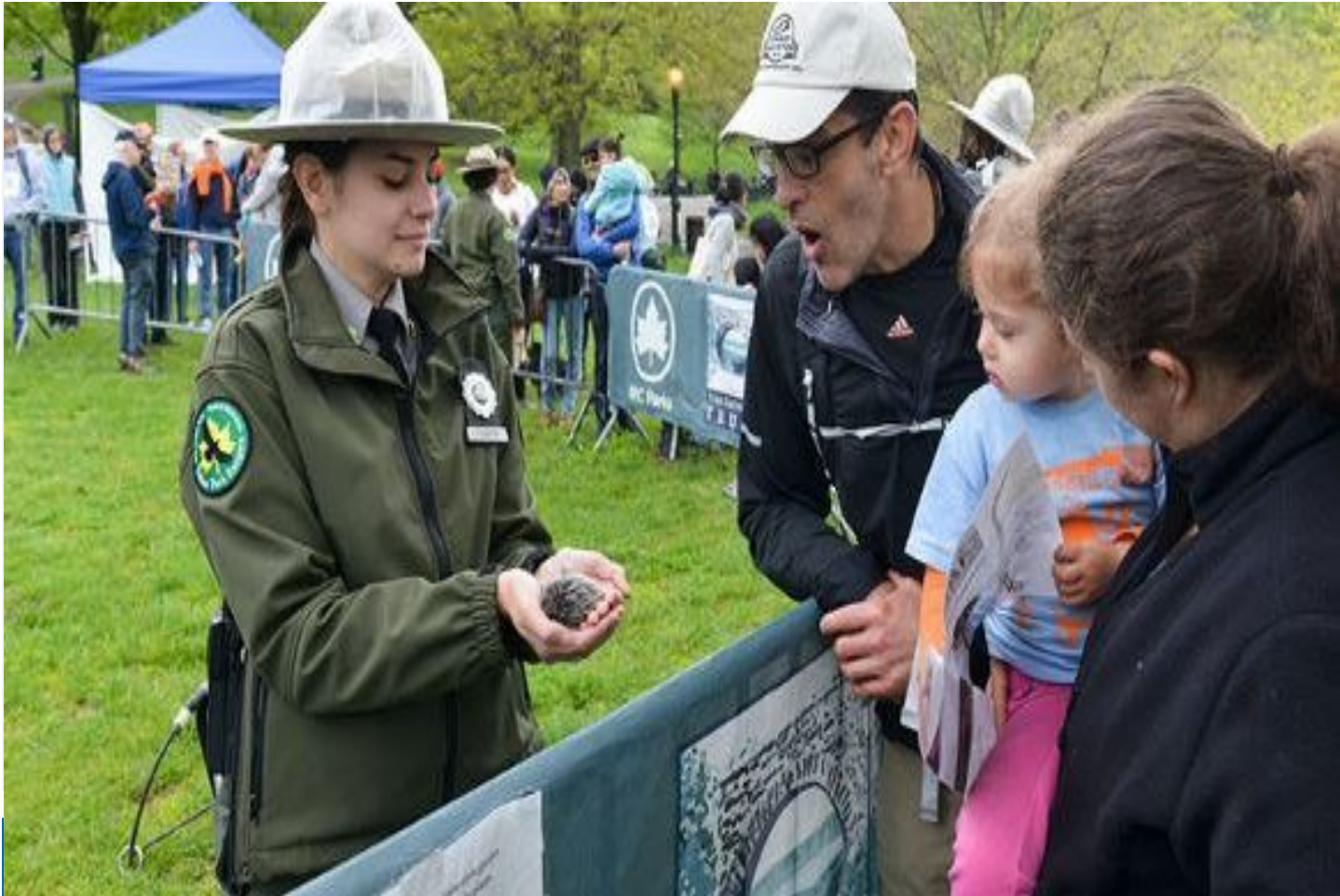
Prospect Park Nature and History Bike Tour