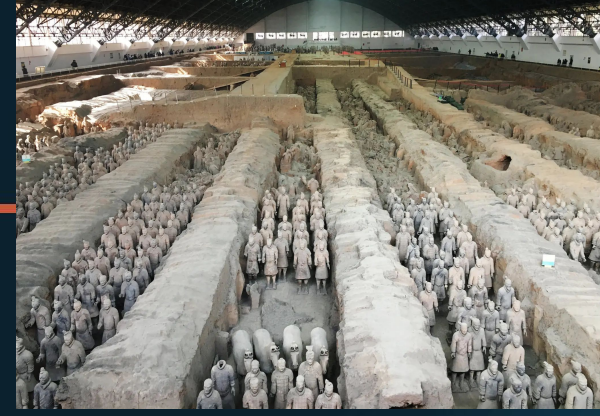
Figure 2: Terracotta Army in Xian