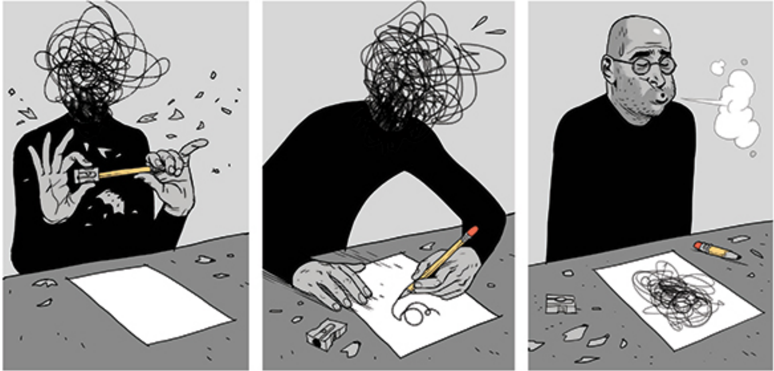
Asaf Hanuka – The Realist