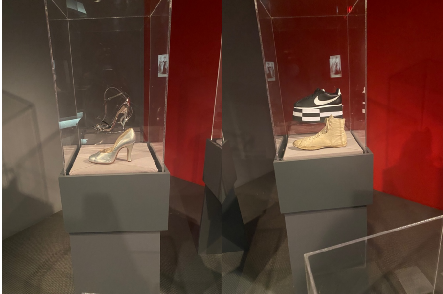
FIT Museum 2022

Also, in the front half of the exhibit, one can observe how designers are not highlighted but can observe prevailing silhouettes of the century aiming to portray the mood of the era. As one moves around the front half of the exhibit, it becomes evident how the exhibition highlighted social place in the world and feminine ideals through clothing, accessories and items. According to the images below and descriptions that I read, a women's accessory, expressed her sexuality propriety and denoted taste and class.