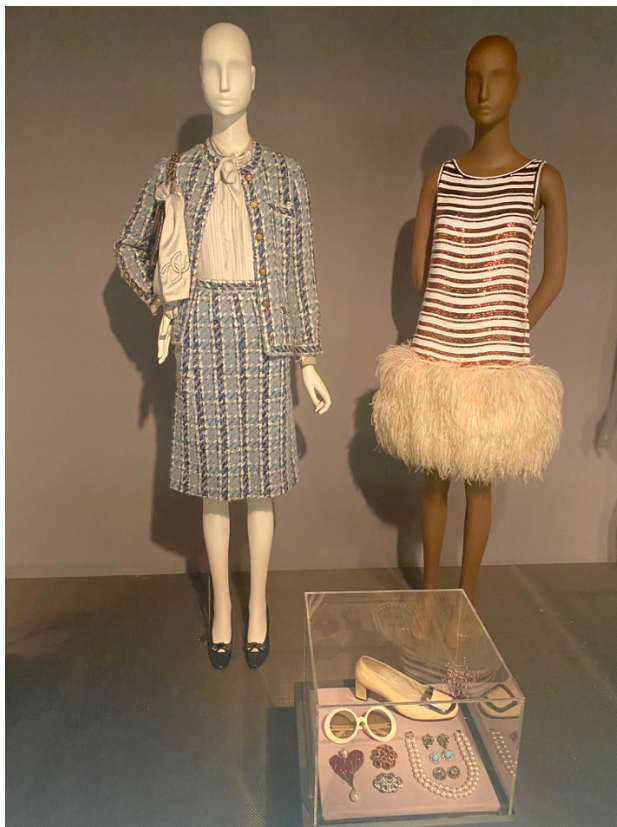
FIT Museum 2022

Back then, order in one's look was important and a priority; women wore confining attire to conform to the ideals of female beauty, and we find designers like Coco Chanel who had a different outlook. Through her creations, she encouraged and liberated women from constricting clothing. Her most famous creation was the Chanel suit (mannequin on the left) which represents a beautiful, powerful, and affluent woman. The spirit of the liberated woman can still be found in all of her vintage clothing and lines of today. Chanel created clothing that was elegant, trendy and comfortable. Her designs were based on functionality.