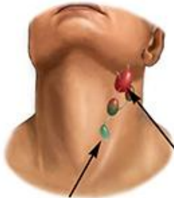
Normal Lymph Node