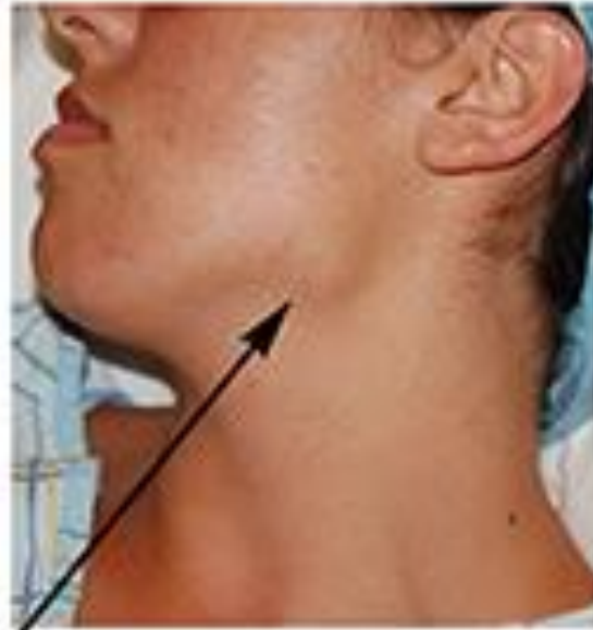
Abnormal Lymph Nodes