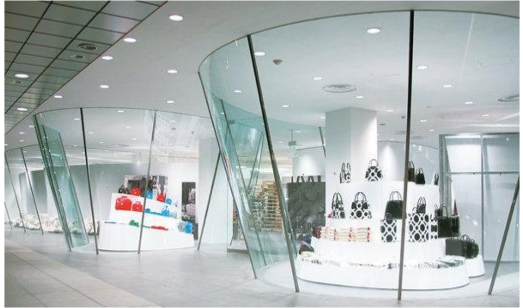
Location: Comme des Garçons (Tokyo, Japan)