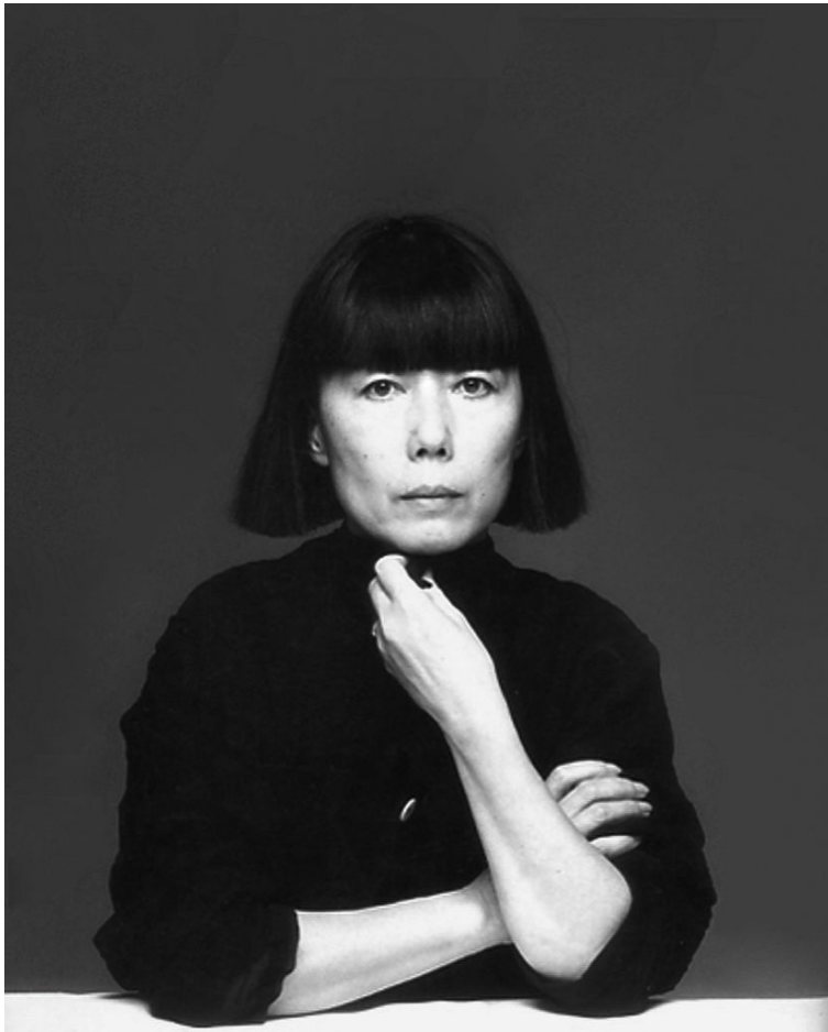
Designer: Rei Kawakubo