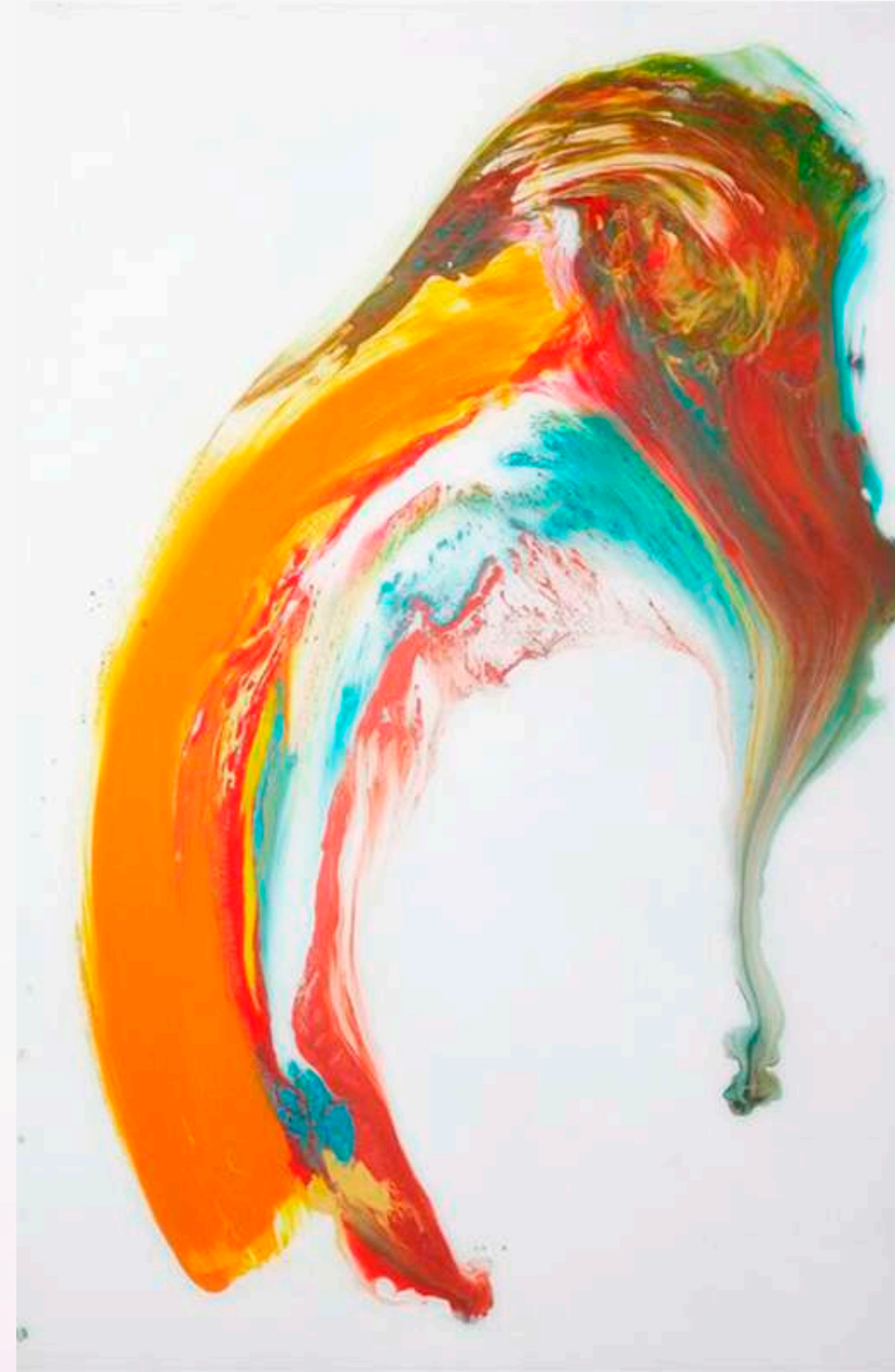
The thing that surrenders by Pablo Saborio. 2019. Acrylic on acrylic glass.