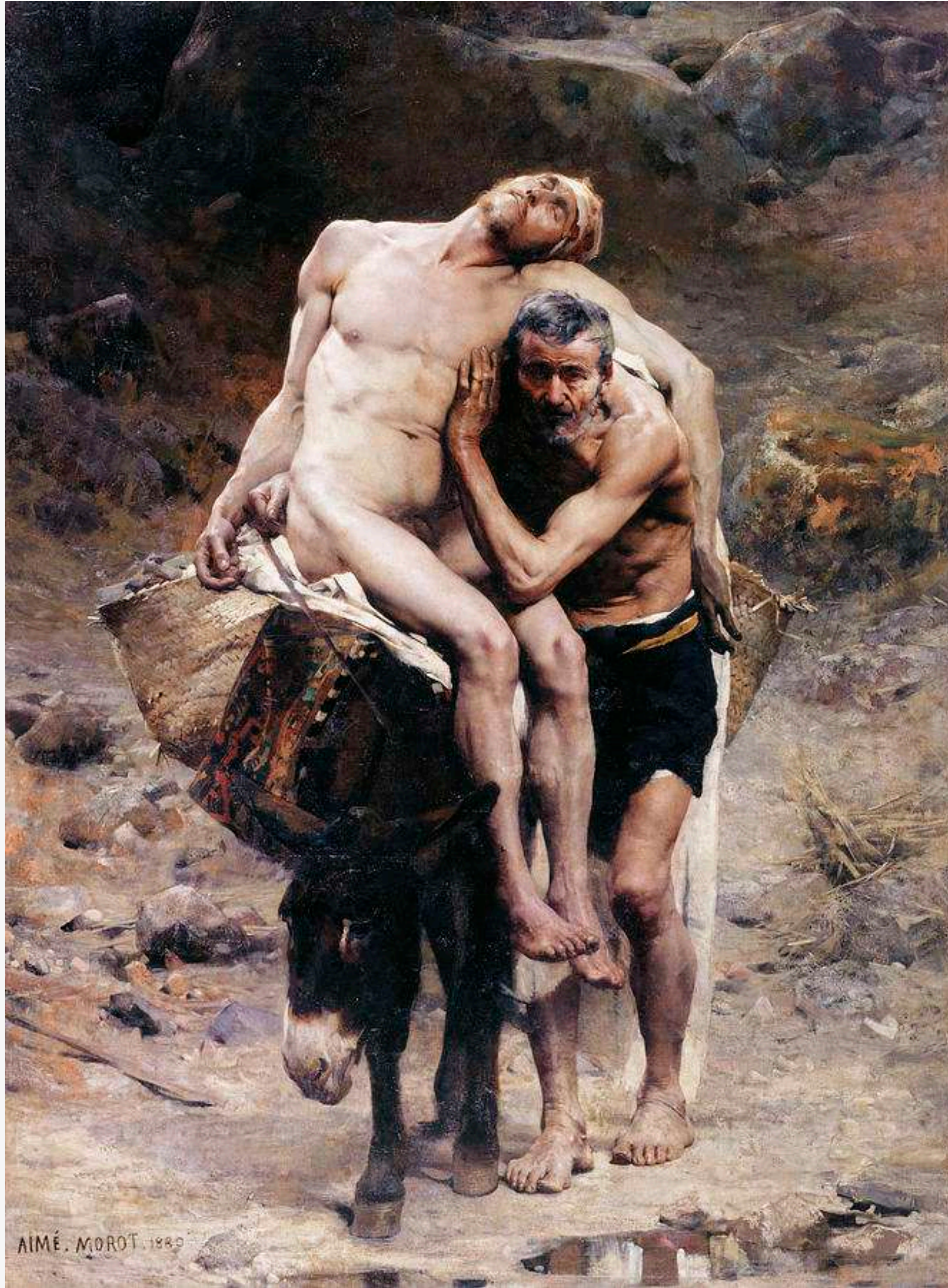
The Good Samaritan by Aimé Morot. 1880. Oil on canvas.

Art has the incredible power to connect people and explore thoughts and feelings in a visceral way. I believe an artist has some responsibility onto them self to create uplifting work that celebrates life. For what else is art but the affirmation of life.