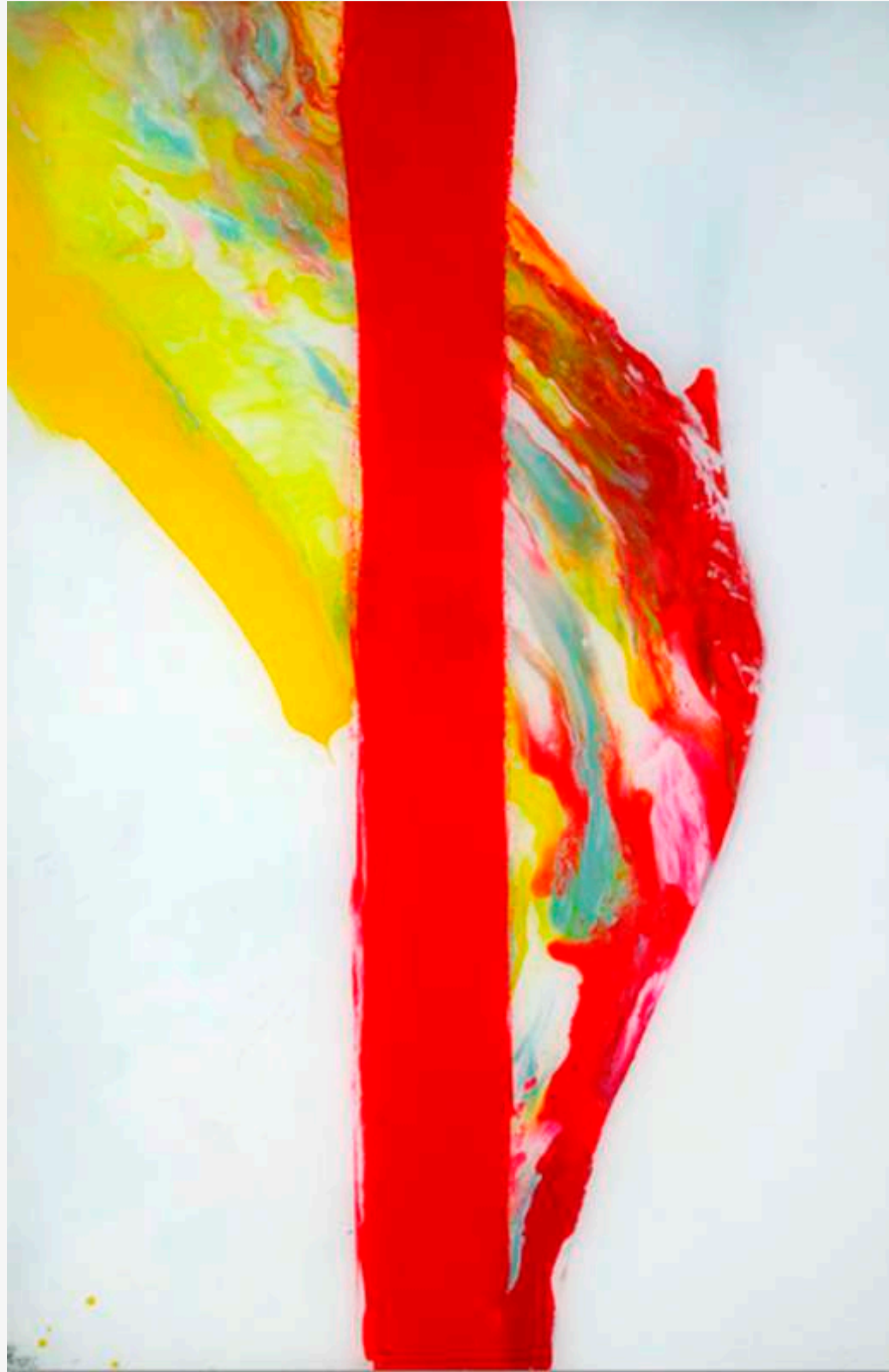
La cosa que contempla by Pablo Saborio. 2019. Acrylic on acrylic glass.