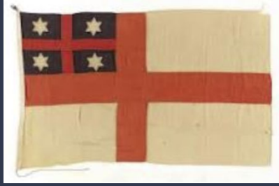
There House Flag