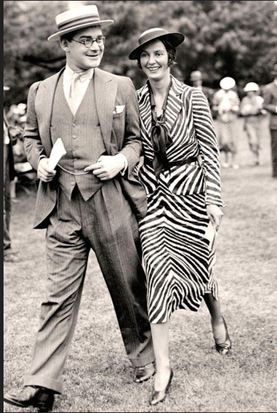
Figure 4. Zebra Print