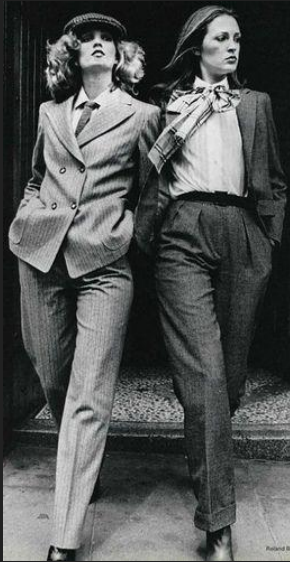
Figure 10. 1970s Trouser suit

During the 1970s women in the workforce began to wear clothing that was inspired by the menswear suits. The trouser suit became very popular for women in the workforce. It became widely accepted by women as a garment that can be worn to work. Although many women wore trouser suits only a few were daring enough to wear suits that resembled the men's suits. These suits were made from the traditional stripe fabric and boxy silhouette. However, most women who wore trouser suits used more feminine prints and colors. Most women continued to wear the traditional skirt and jacket/blazer to work because there were policies put into place by companies on what clothing was acceptable for women in the workplace. Many women who dared to wear trouser suits that resemble mens suiting were sent home for the day. Some very popular prints during the 70s for women's suits were floral prints, animal prints, and light or dark colors depending on the season.