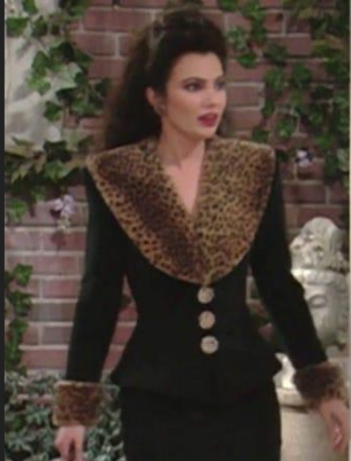
Figure 14. Fran Fine in a leopard print suit. CBS