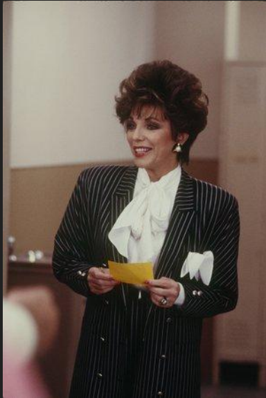
Figure 13. Joan Collins in Dynasty, 1980s.

Sullivan, K. (2016, November 7). The Fascinating History of Women Wearing Suits . Allure. https://www.allure.com/story/women-suits-history .