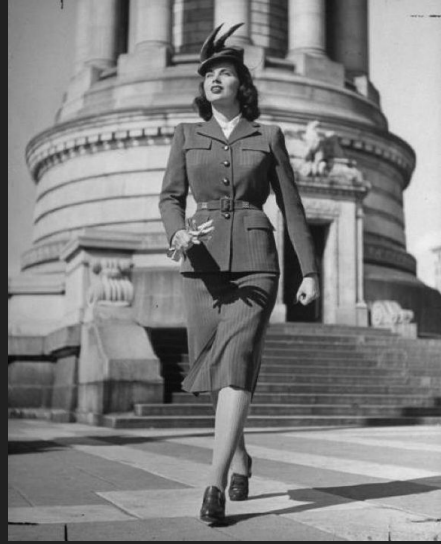
Figure 7. Women's 1940s Victory suit

The women's suit in the 1940s changed from the very feminine silhouette back in the 1930s to a more masculine silhouette. One would say that these new suits were militant in style. Thus began the new trend known as the utility suit and/or Victory suit . The utility suit was “simple but stylish, with good proportion and line. It incorporated padded shoulders, a nipped-in waist, and hems to just below the knee” (Reddy, 2019). The suit had a boxy silhouette. It consisted of an A-line skirt with a matching Jacket. The jackets had shoulder pads to create the illusion of broad strong shoulders and a tiny hourglass waist. Some of the most popular fabrics used to make these suits were cotton and wool as it was easier to access during the war. The men's military suits were made from these fabrics, therefore oftentimes the women's suits resemble military uniforms. The suits were limited to a few colors such as black, blue, grey, red, brown, and green. Plaid prints were very popular prints worn by women.