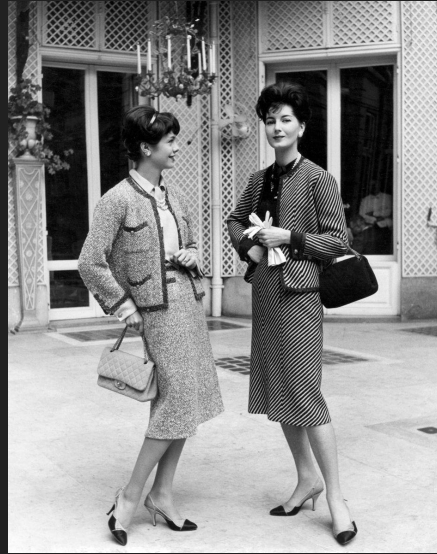
Figure 9. Chanel tweed suit