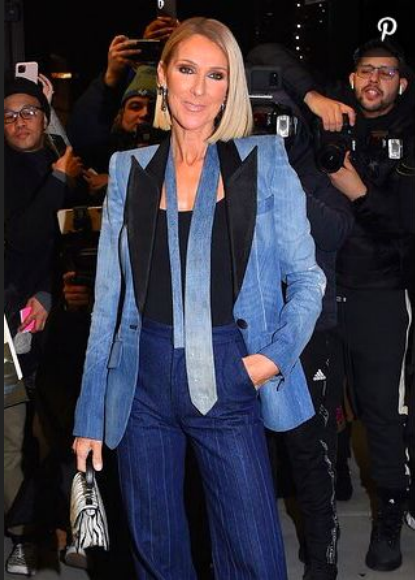
Figure 16.

Cosmopolitan stated that “The 2000s were a confusing time for style.” (Manning, 2020) In the 2000s trend, there are different elements was blended in one style, for example, a person is wearing a bohemian top with a mini layered skirt and below knee boots. During the 2000s era, women's suits weren't that popular anymore. People are more into denim style, bohemian style, and tracksuits. Even though suits were not as popular as before, there are certain elements from suits applied on 2000s fashion trends such as random ties and capri pants with suit jacket sets. For example, Celine Dion wore the tie as a scarf with a denim suit set and a white tee.