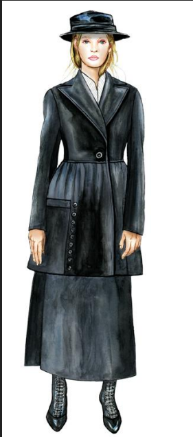
Figure 2. Suffragette Suit