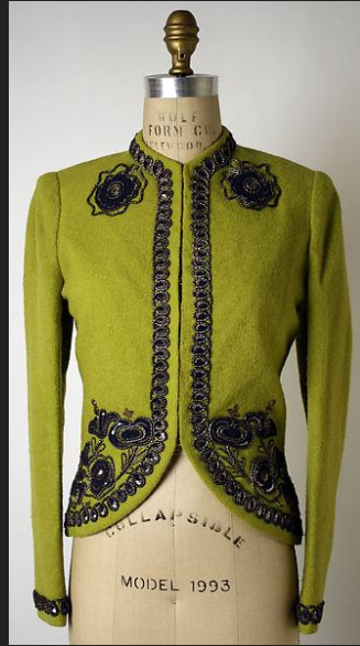
Figure 5. Sequins jacket

Reddy, K., & Reddy, K. (2019, April 5). 1930-1939. Fashion History Timeline . https://fashionhistory.fitnyc.edu/1930-1939/