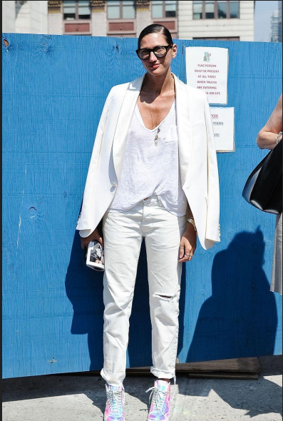
Figure 17. Daniel Zuchnik / Getty Images