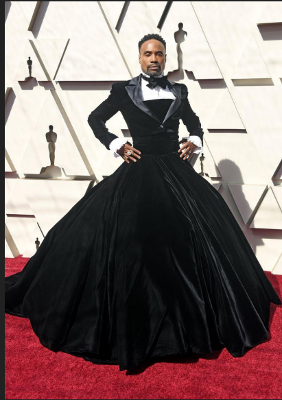
Figure 18.