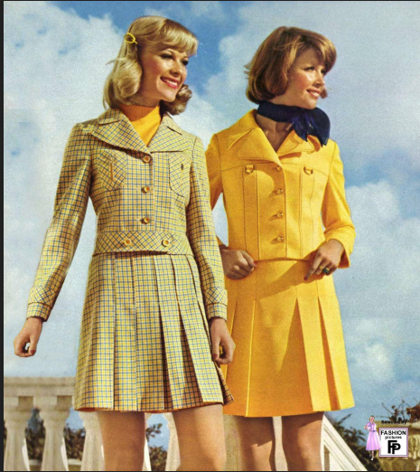
Figure 10. That 60s Girl