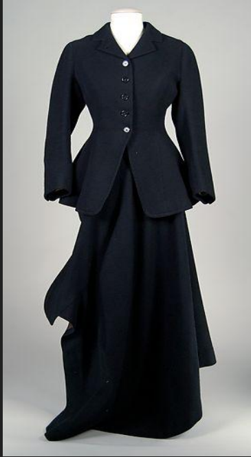
Figure 1. Riding Habit