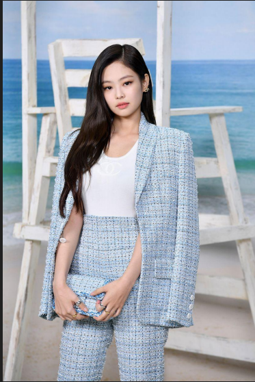
Figure 19.