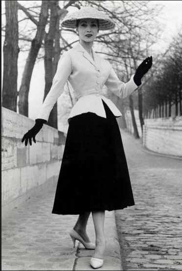
Figure 8. Christian Dior's New look