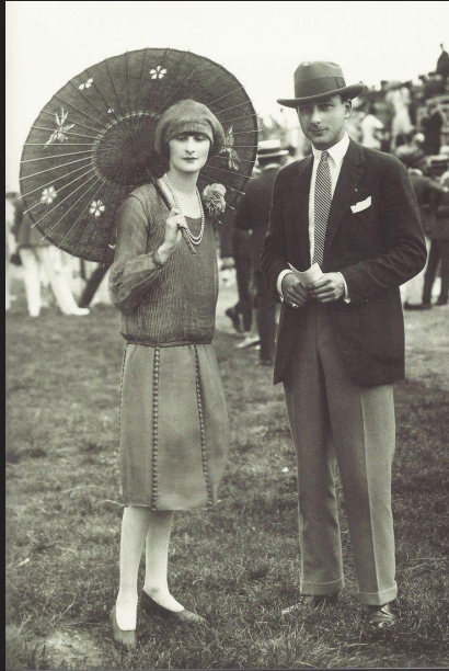
Figure 3. Cardigan style jackets

During the 20s, the aftermath of the First World War was still being felt around the world. In the 1920s, fashion was all about the full package, and there were even trends in how the body was dressed. Fashion's basic lines and androgynous proportions looked best on bodies without curves. While the above-mentioned designers manufactured and sold their styles, as did department stores and the like, the simplicity of the prevalent mode during the 1920s made it easy for women of all means to duplicate those fashions at home. This, paired with influence from normal working-class ladies' clothes and the usage of fabrics like jerseys and imitation silk, resulted in the 1920s "democratization of fashion."