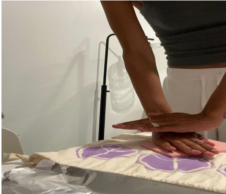
1. Cloth dust bag, purple and pink ink, foam painting brush, Speedball block printing kit.