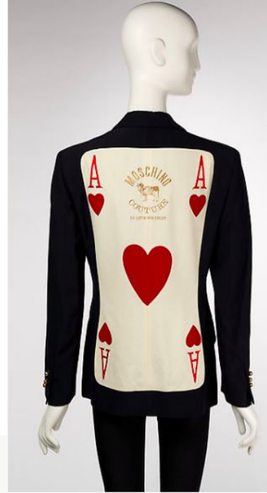
Ace of hearts blazer fall 1989