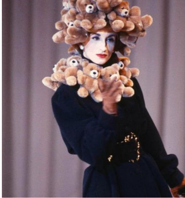
1989 "fun fur collection"