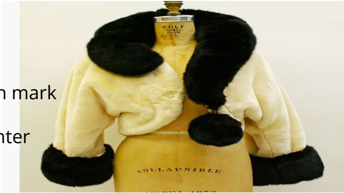
Question mark coat 1994 winter