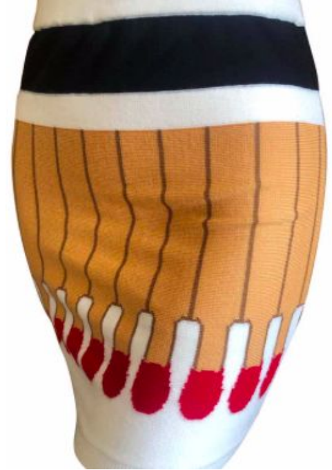
1990 "Matches mini skirt"