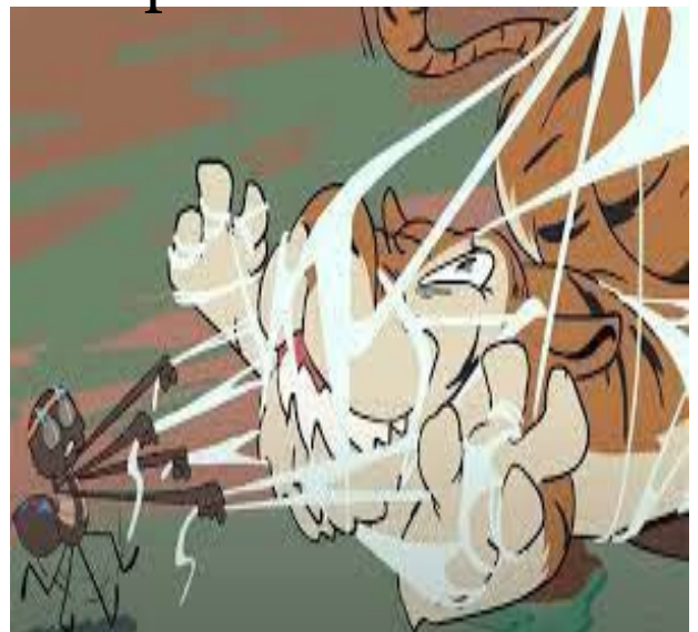
Capturing the tiger