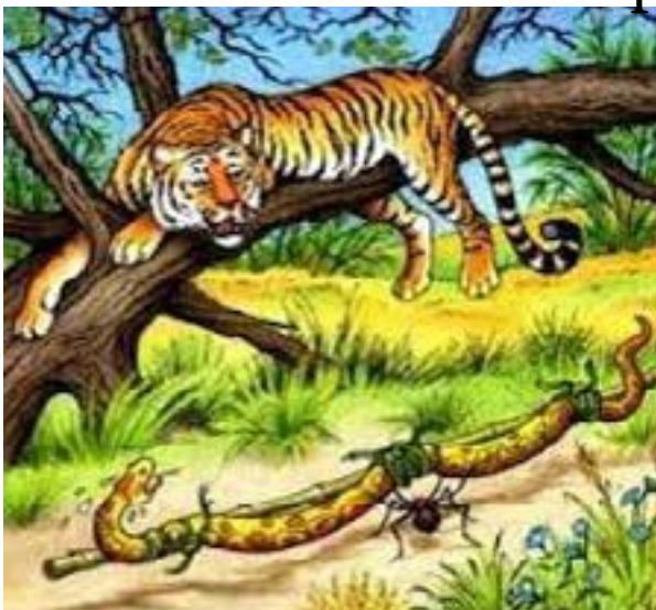
Capturing the python