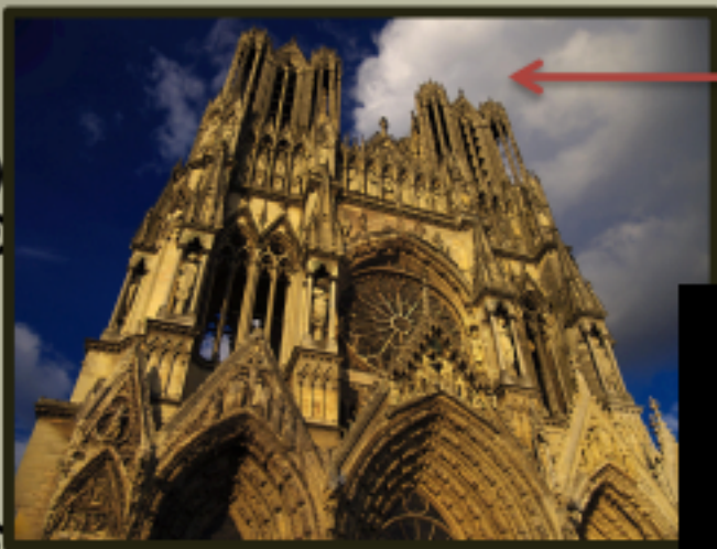
Reims Cathedral- Bernard de Sissons Built in 1211, Reims, France