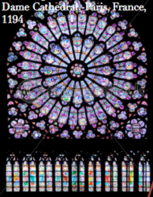
Stained glass windows in Notre Dame Cathedral, Paris, France, 1194