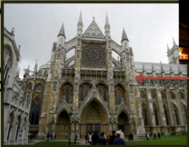
Westminster Abbey- Henry III, 1245, London, England