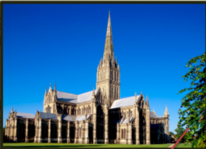
Salisbury Cathedral- Architect unknown, Salisbury, England, 1220