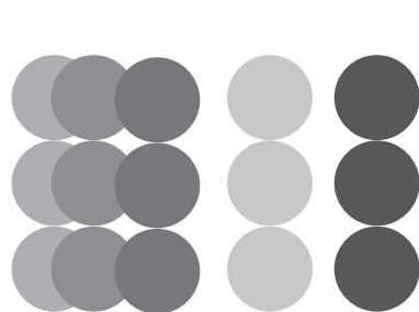
pattern based upon similarity

Pattern can be organized by similarity (things are alike and placed in a consistent manner) or they can be organized by proximity (things are unlike but placed in a consistent manner as in grouping)