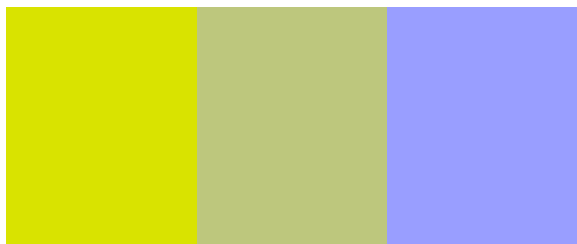
sample set 2

in this one, the overlap is closer to the color on the right showing it is on top of the two shapes