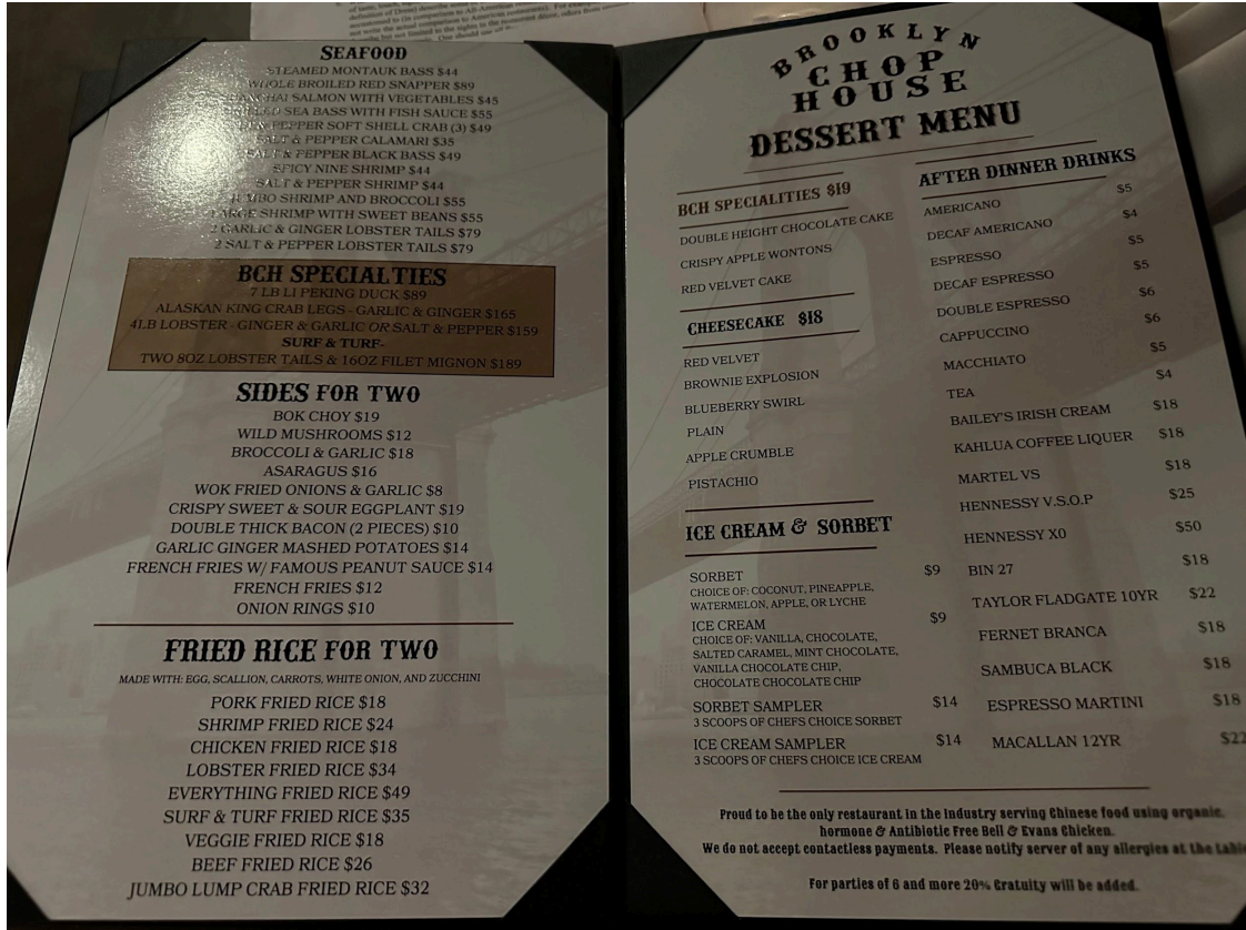
Figure 4. Brooklyn Chop Food Menu