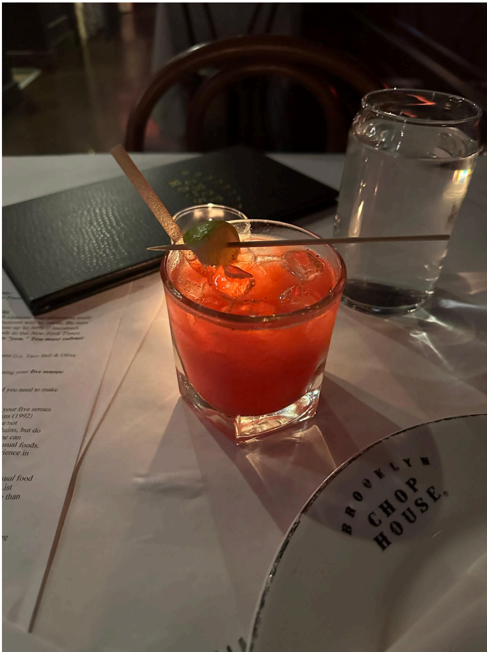
Figure 2. D'USSE VSOP