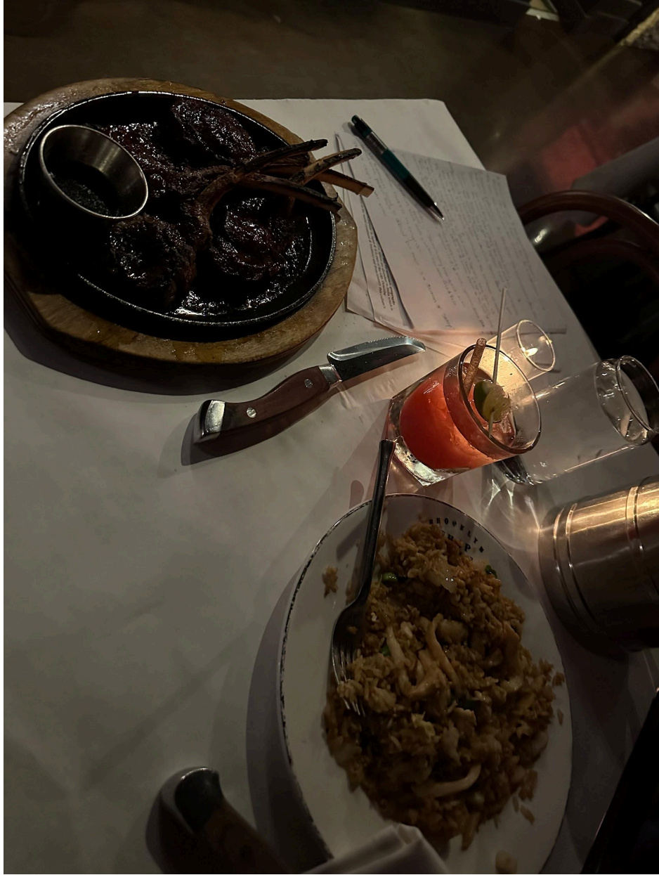
Figure 5. Colorado Lamb Chops & Chicken Crispy Rice