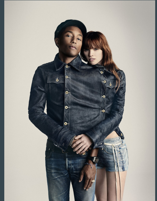
(G-Star RAW, 2016)