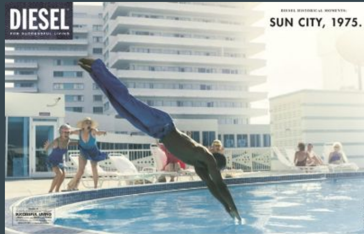
Finally It All Makes Sense: (Diesel Adverts 1991-2001)