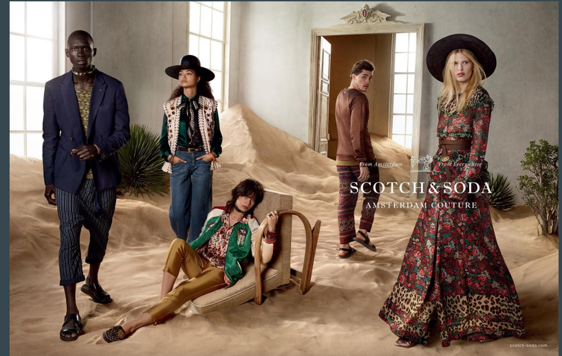
(Publicis 133, 2017)