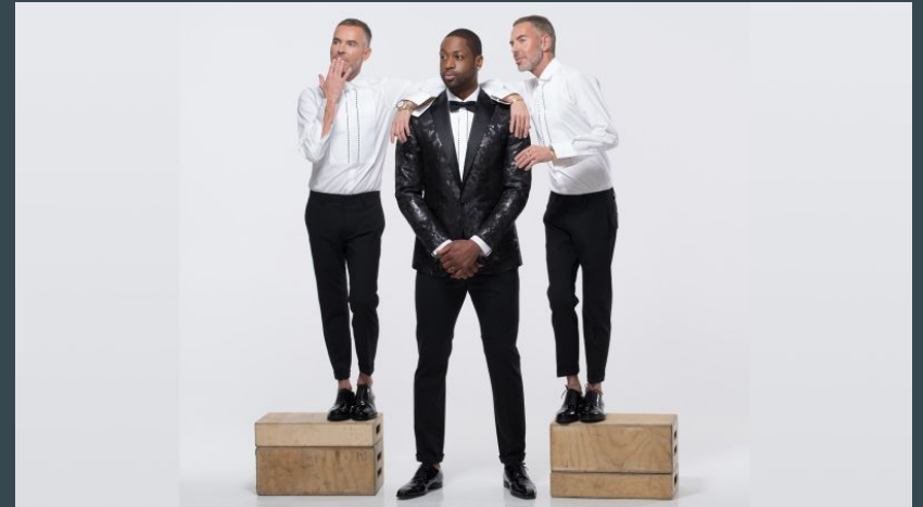
(Saks 5th Ave, 2017)