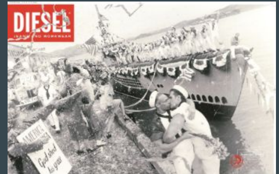
Figure 1: Finally it all makes sense (Diesel Adverts 1991-2001)