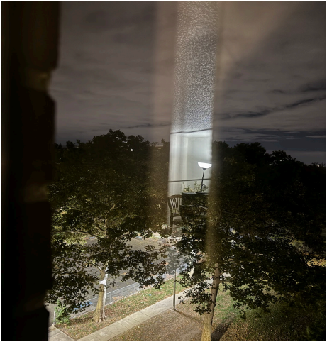
Light My Way Home (2024)