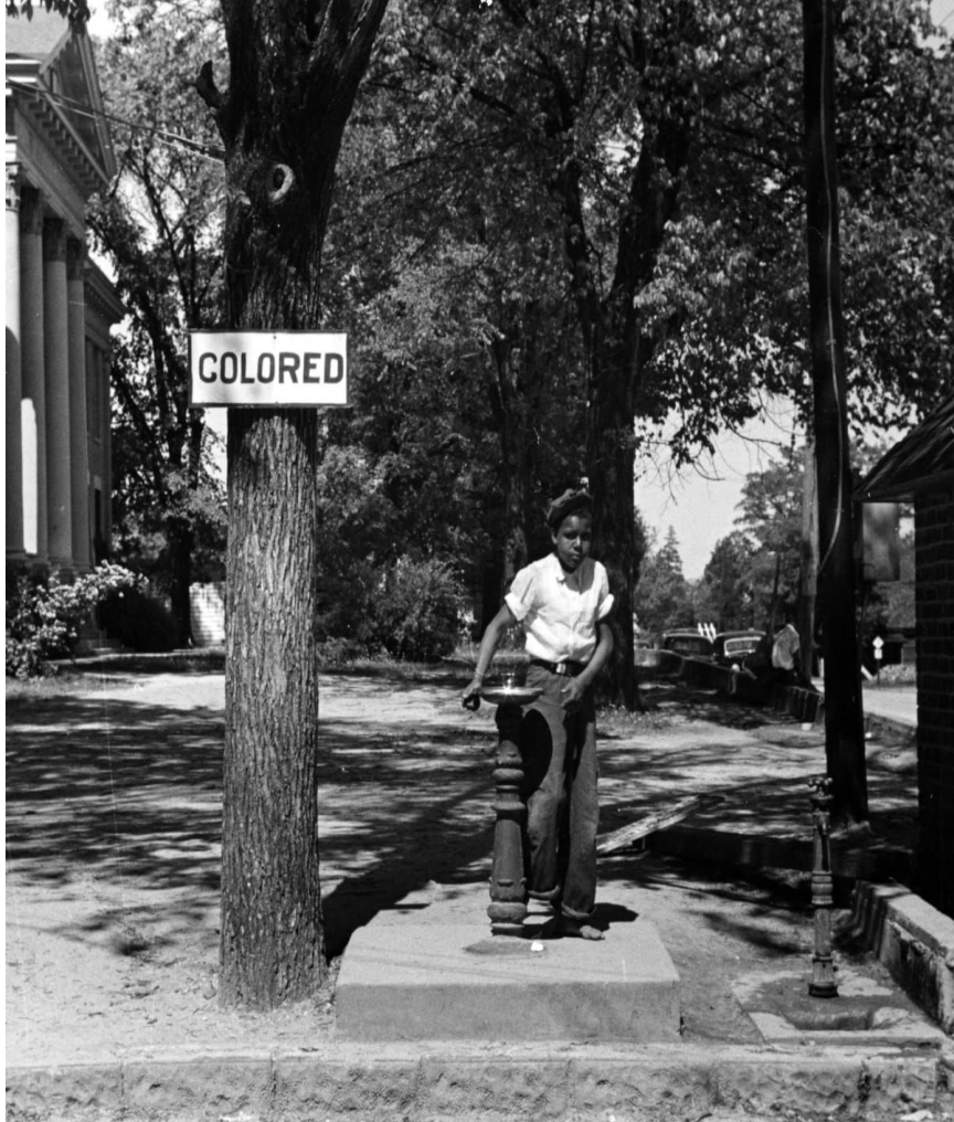
areas for people of color

and white people with supposedly equal treatment.