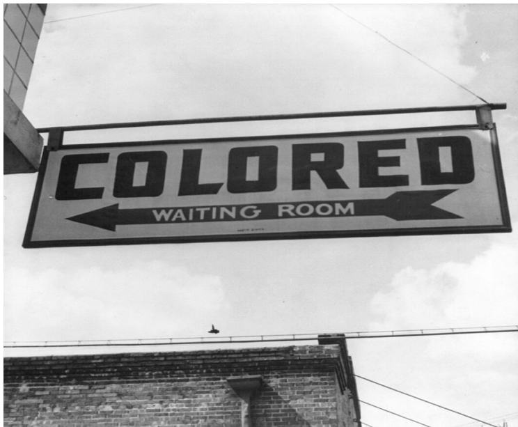
in other words, segregation was another type of slavery.