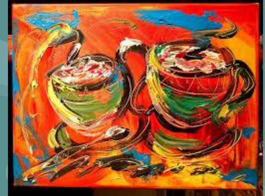
Two Cups $800