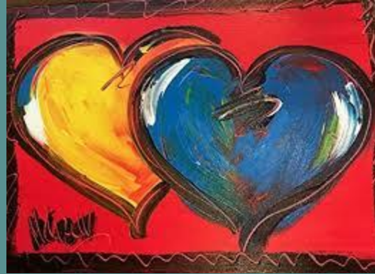
Two Hearts $1,000