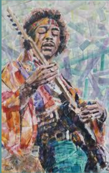
Jimmi Hendrix $2,500