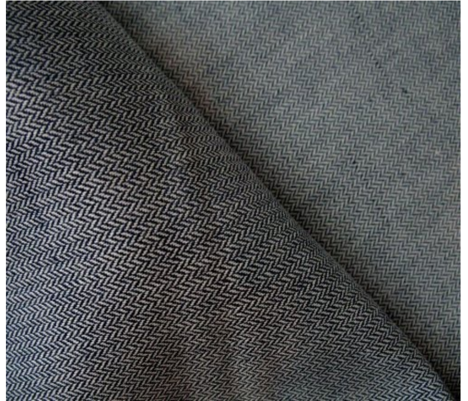
Type of Woven: Herringbone Twill URL: https://www.celticfusionfabrics.com/ourshop/prod_3578901-Robert-Kaufman-Bradford-Herringbone-twill-linen-mix-INDIGO-wide.html