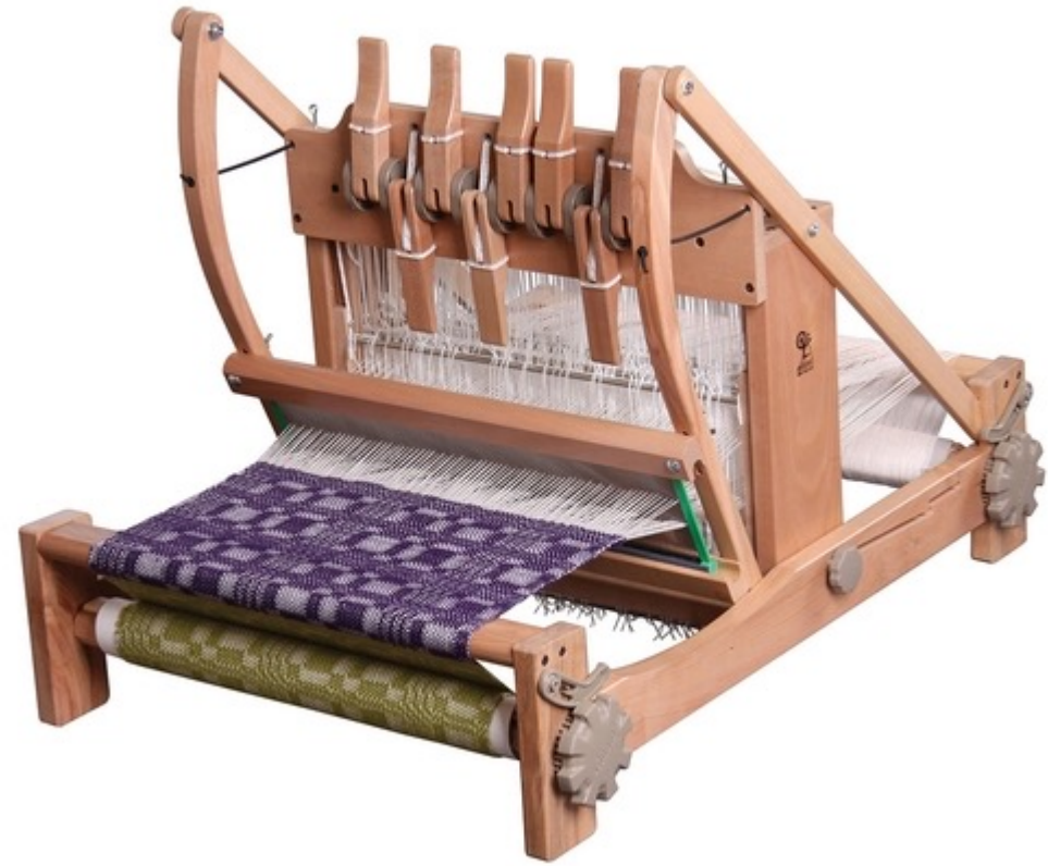
Type of Woven: Table Loom URL: https://woolery.com/ashford-table-loom-8-shaft.html