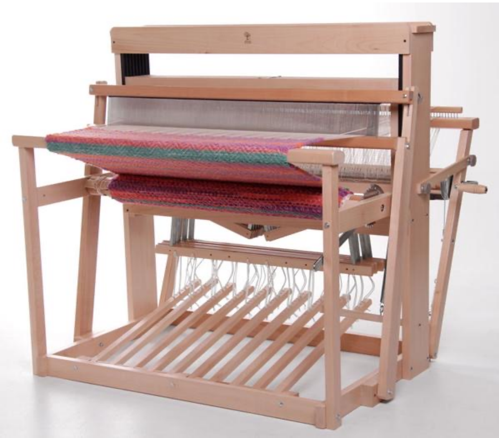
Type of Woven: Floor Loom URL: https://spincityshop.com/products/ashford-jack-loom-8-shaft-floor-loom