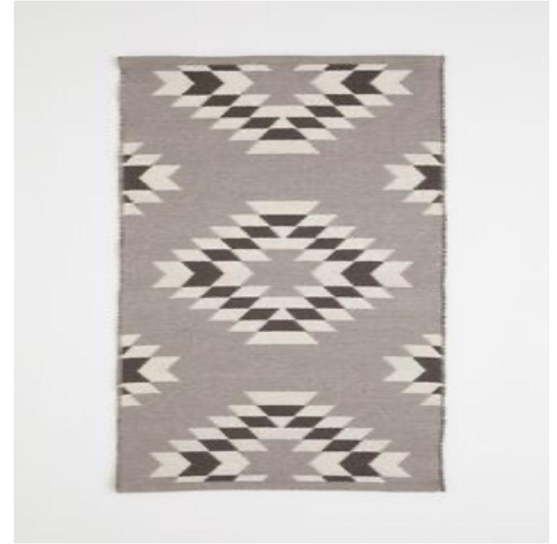
Type of Woven: Jacquard Weave URL: https://www.pinterest.com/pin/182536591131578184/