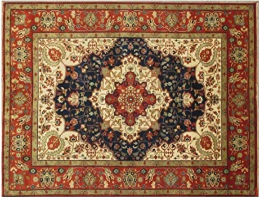
Type of Woven: Handmade Pile Rug URL: https://www.amazon.com/Handmade-9x12-Serapi-Indian-Original/dp/B07B4YQH1H