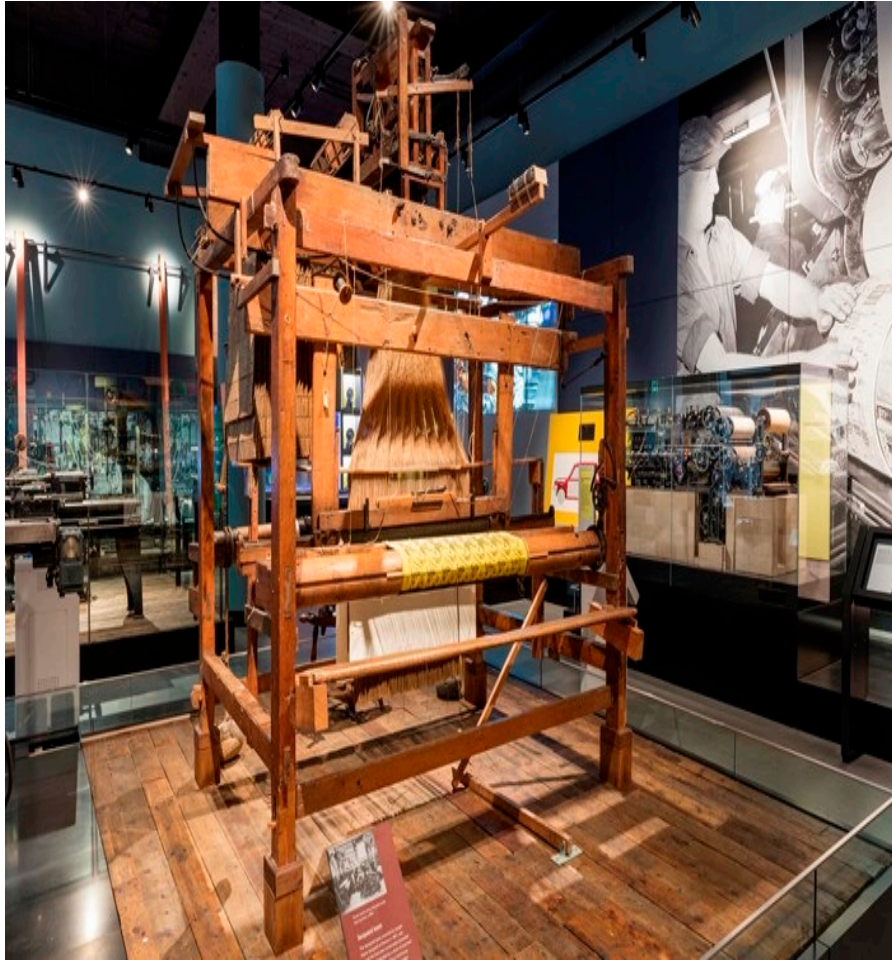
Type of Woven: Historic Jacquard loom URL: https://www.nms.ac.uk/explore-our-collections/stories/science-and-technology/jacquard-loom/