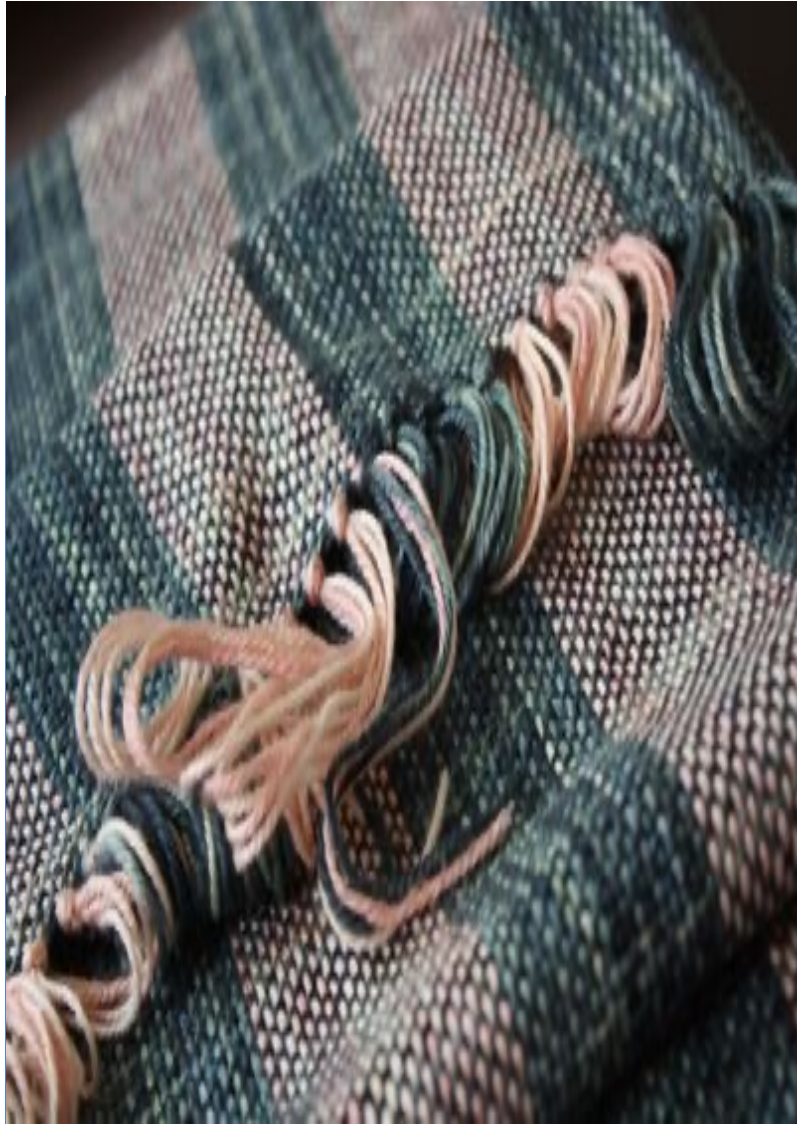
Type of Woven: Plain Weave URL: https://warmthinthnorth.typepad.com/warmth_in_the_north/2009/05/plain-weave-scarf.html