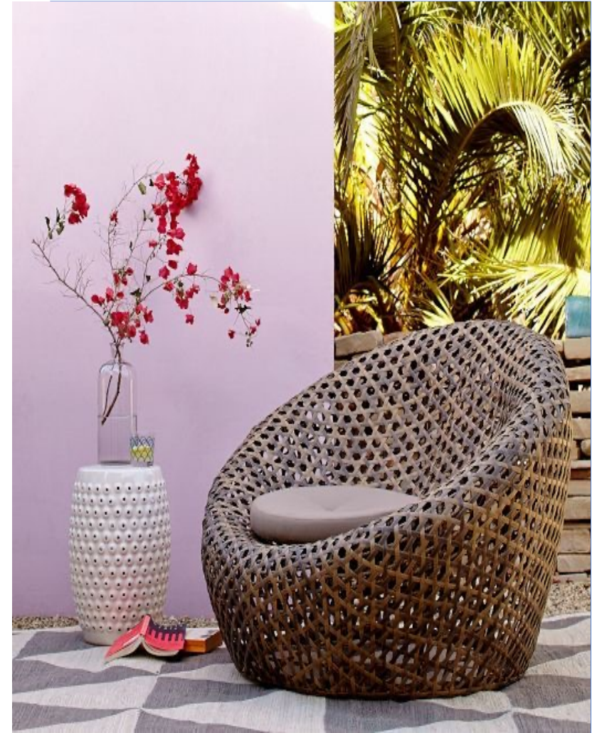
Type of Woven: Basket Weave URL: https://www.trendhunter.com/trends/montauk-nest-chair