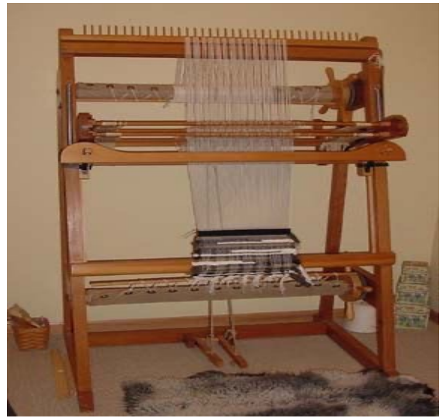
Type of Woven: Vertical Rug Weaving Loom URL: https://www.pinterest.com/pin/538039486703967199/