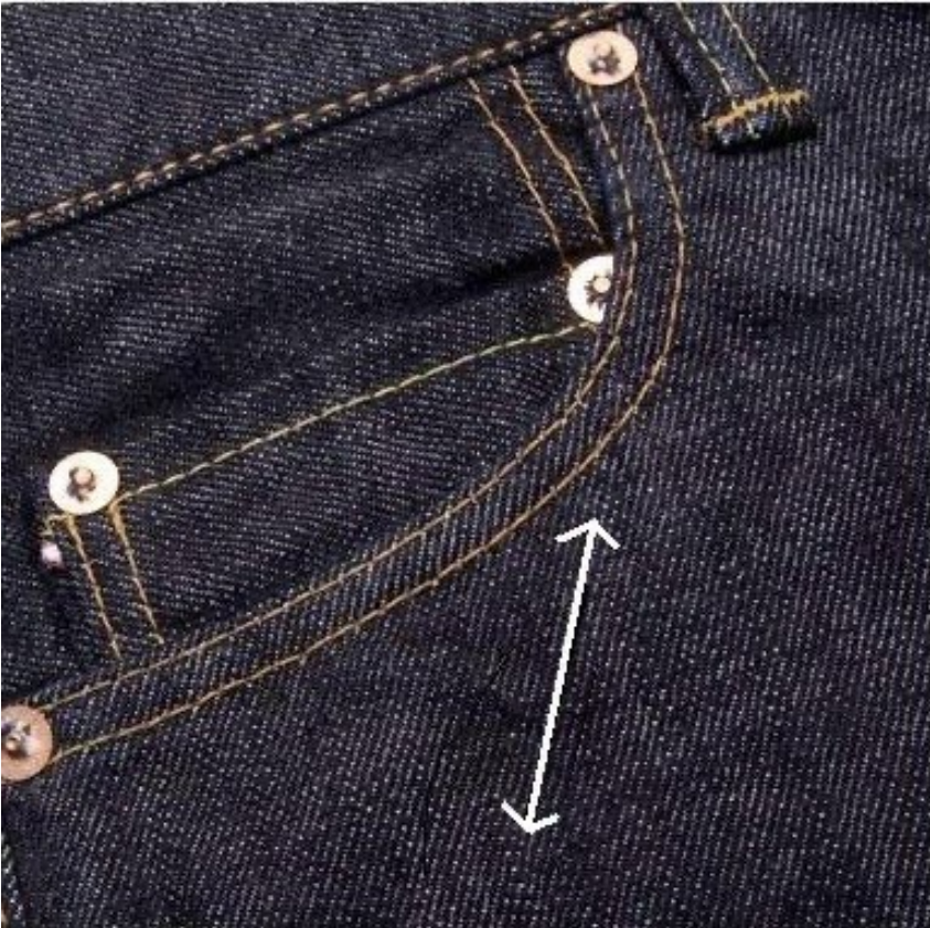
Type of Woven: Right Hand Twill URL: https://www.heddels.com/dictionary/right-hand-twill-rht/