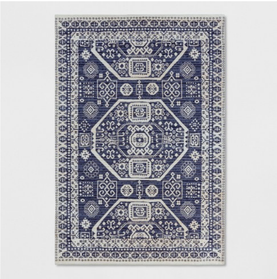
Type of Woven: Jacquard Weave URL: https://www.target.com/p/blue-jacquard-woven-rug-threshold-153/-/A-53405678