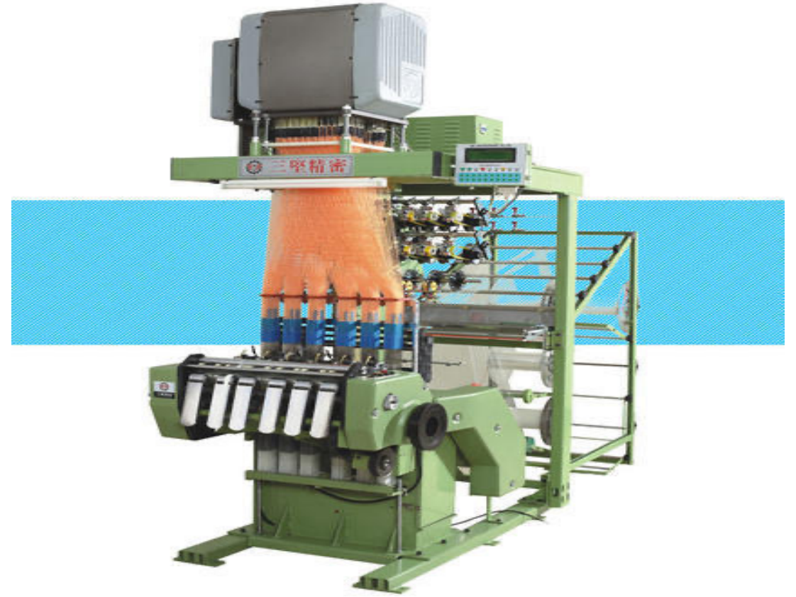
Type of Woven: Computerized Jacquard loom URL : https://www.indiamart.com/proddetail/computerized-jacquard-loom-8217947033.html