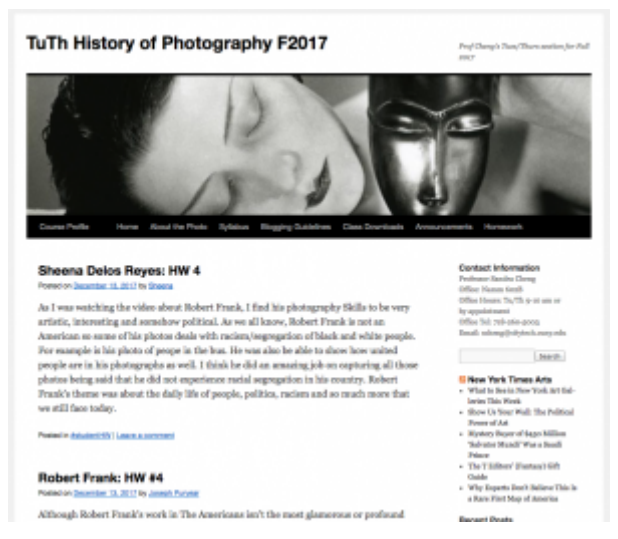
Cheng's History of Photography Site

Now that you've had some time to look around and start using the OpenLab. Move along to the third portion of this module: Best Practices.