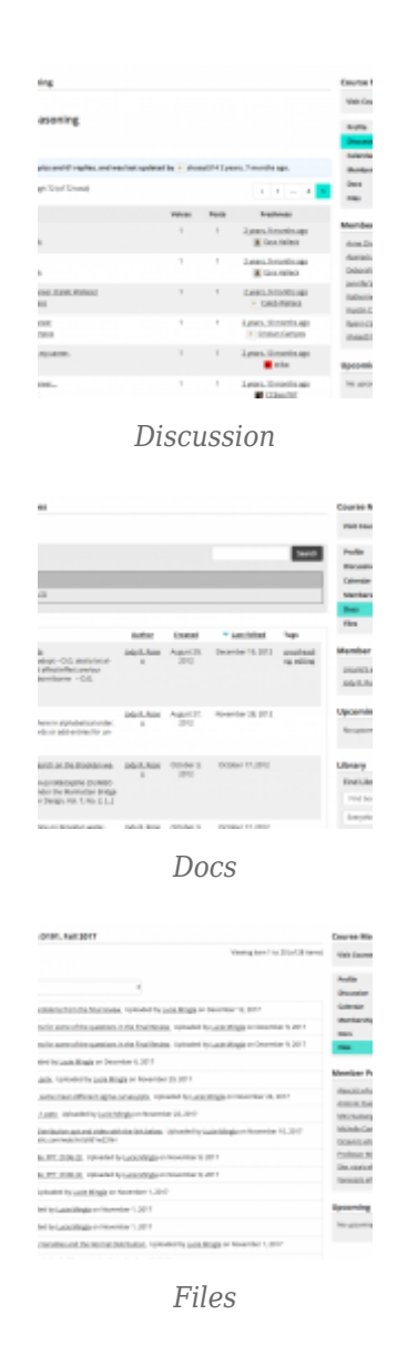
The site, however, is where the dynamic and customizable work can happen. For some introductions of what you can do with your site, take a look at our robust help documentation focused on building out your site. If you get confused or frustrated, however, don't hesitate to contact the Openlabfor basic help by email, come in for an office hour, or attend a workshop. You can always see the schedule for those and RSVP for the workshops on the Open Road.