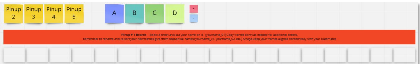
Sample Miro.com Case Study – Individual Progress Pinups

We will pinup progress work of your Individual Revit Drawings in MIRO. You will be required to post for each class. Your professor will determine the requirements for each pinup as the project progresses.