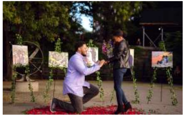
Clifton proposed in the same place where they had their first date in 2014.

Clifton: I hate when people use sarcasm as a way to make you stop talking. Like if they