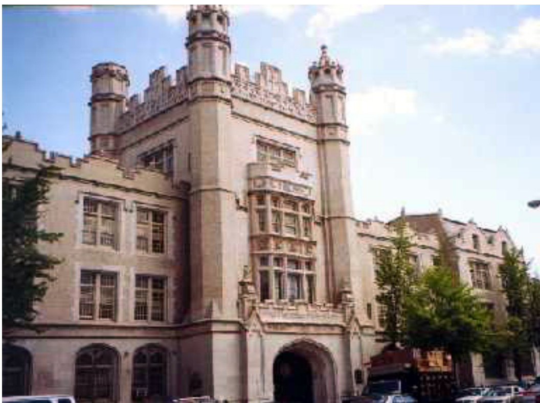
ERASMUS HALL HIGH SCHOOL