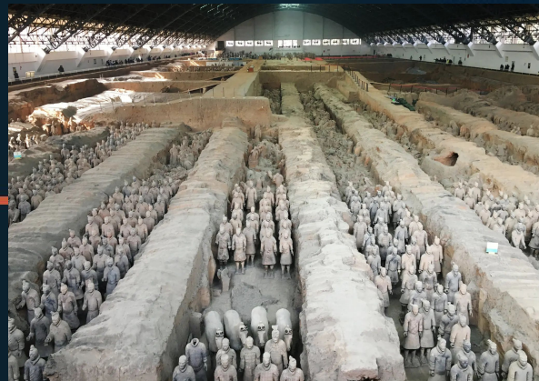
Figure 2: Terracotta Army in Xian