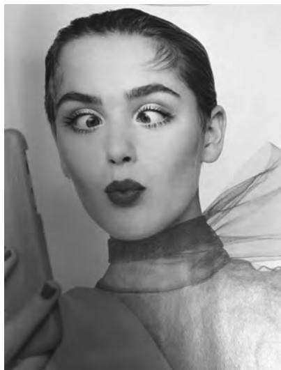
Sample of "Selfie"