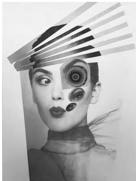
Sample of Selfie Collage on Bristol Board 9x12"