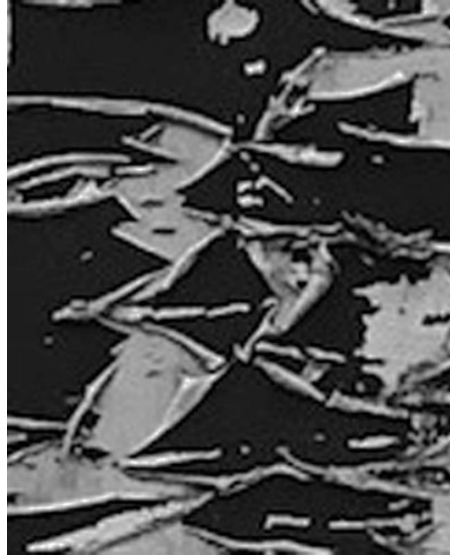
Ambiguous figure/ground example