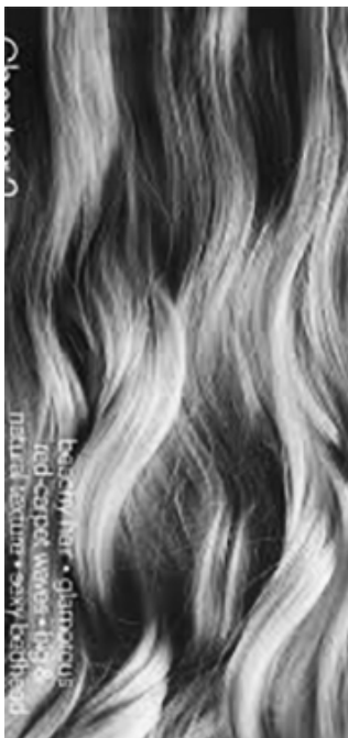
Sample of "Texture" selected image