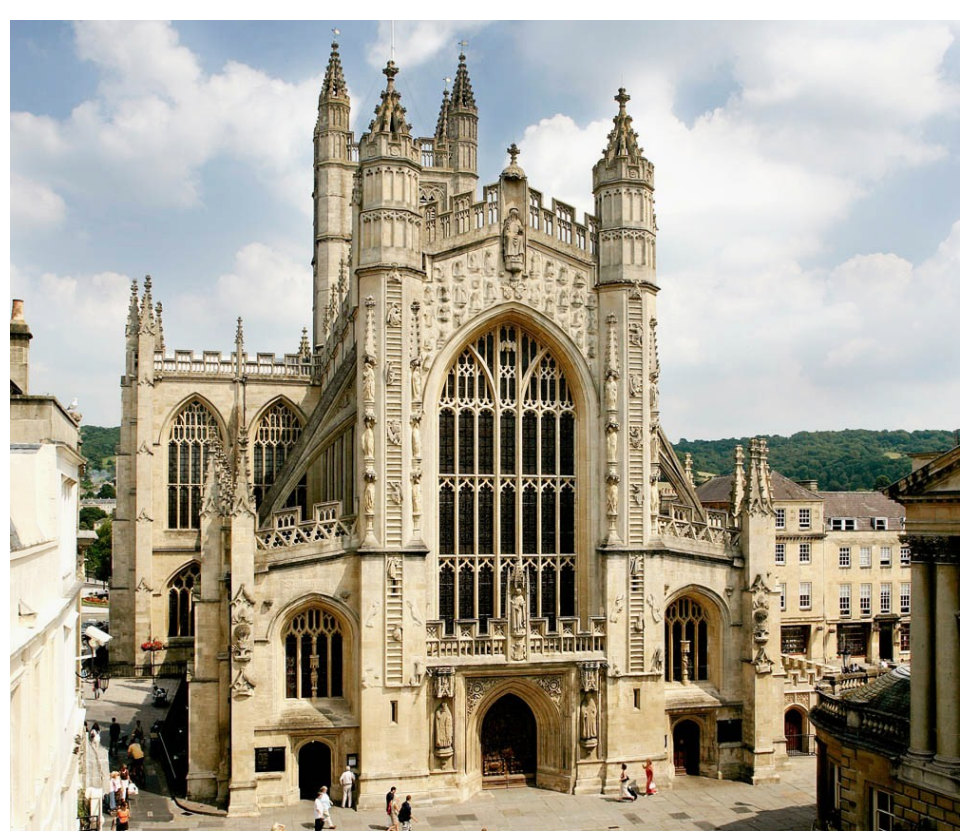
West Facade, Bath Abbey, England12th-16th Century English Gothic