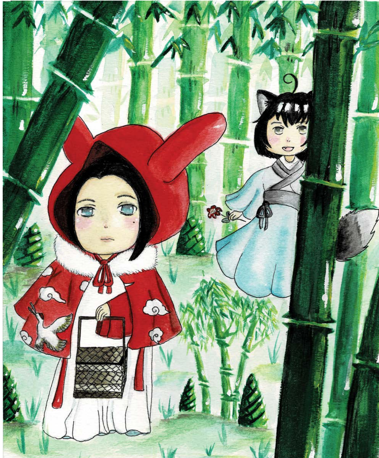
Water color palette: