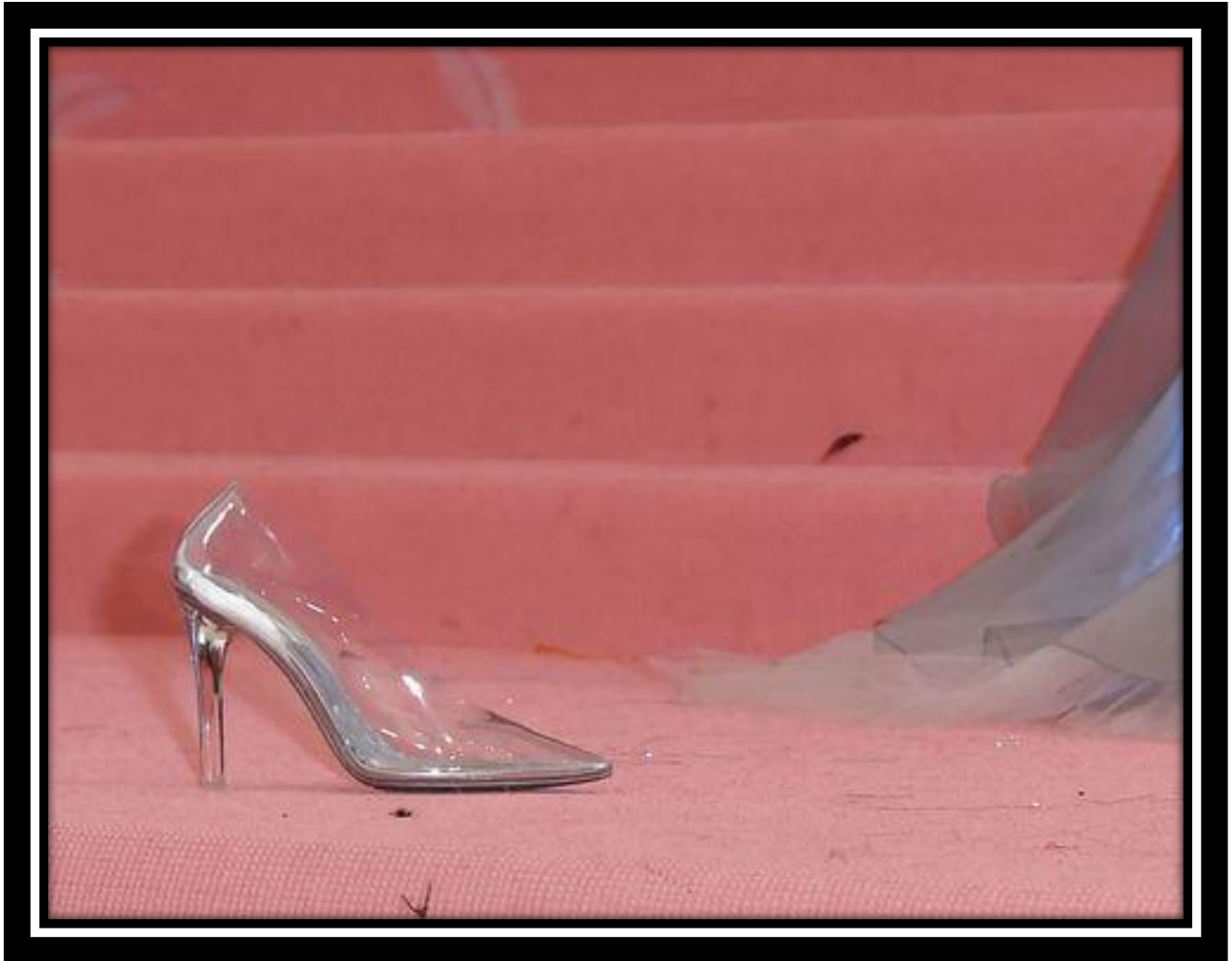
Figure 4. Zendaya's Cinderella glass slipper left on the pink carpet of Met Gala, 2019.