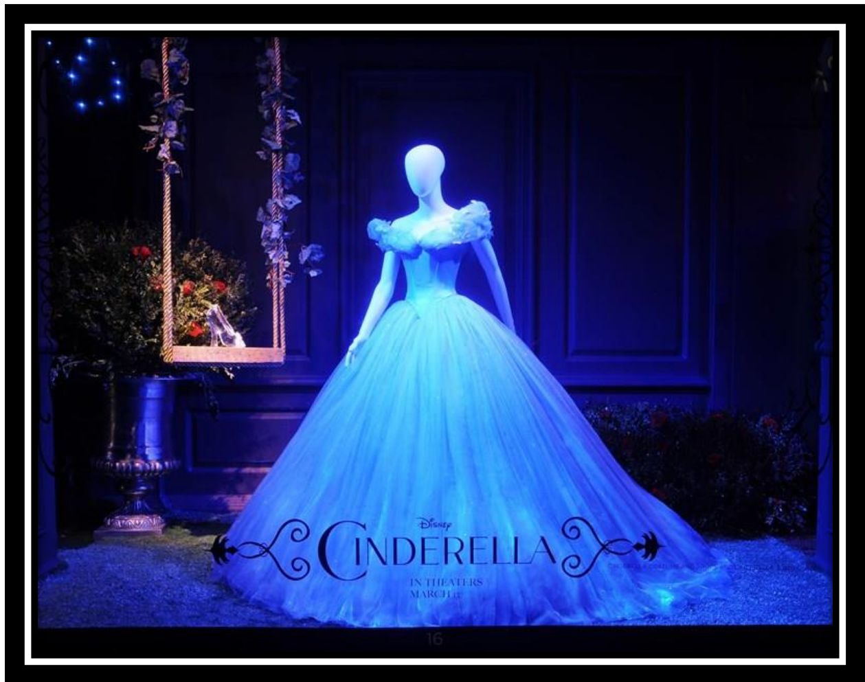
Figure 2. Saks Fifth Avenue displaying the original princess gown and glass slippers (on the swing) used in the remake of Cinderella movie in 2015 for promoting this Disney film.