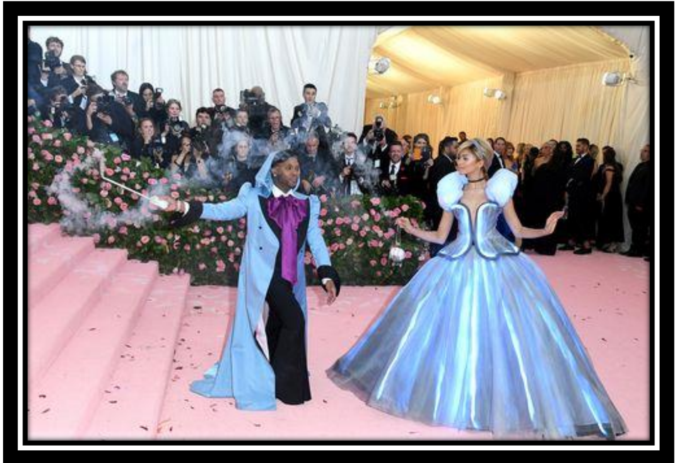
Figure 3. Zendaya dressed up in a Tommy Hilfiger version of Cinderella gown was lighting up the pink carpet at Met Gala 2019. She wore glass slippers and was holding a carriage purse