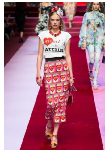
Figure 5: Dolce and Gabbana Spring 2018 Outfit No.14

Proportion describes the size scale of a specific part of a whole garment. Outfit No. 14 plays with proportions. The pencil skirt makes up a big part of the outfit. Commonly, skirts are shorter or at least not much longer than tops; the pencil skirt in question, however, covers everything from the waist to the calves and is twice as long as the t-shirt. The proportions make the outfit look girlish but also sexy and mature and make it an eye-catcher. Breaking with conventions is very normal to Pop art and can therefore also be found in Outfit No. 14.