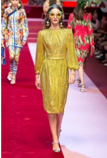
Figure 1: Dolce and Gabbana Spring 2018 Outfit No.100

In Dolce and Gabbana's Outfit No. 100, an elegant, retro, yellow-golden dress is contrasted with casual and fun accessories; for the viewer's amusement, the round and oval sunglasses have