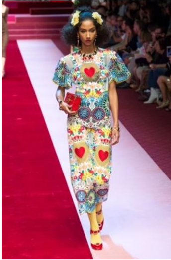
Figure 3: Dolce and Gabbana Spring 2018 Outfit No.40

Dominance is the emphasis on a special/ primary area in the design of a garment. While Outfit No. 40 does not seem to be explicitly inspired by one of Andy Warhol's works, it still shows influences of Pop art. Particularly the prominence of the red hearts as opposed to for example the blue circles and other shapes reminds us of the focus of Pop art on popular and feasible matters. The hearts look popped up, catch the audiences' eyes, and make the area around the hearts appear monotonous because the hearts are very strong and also the rest of the dress is adorned with flourishes. At first sight,