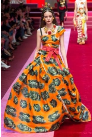
Figure 2: Dolce and Gabbana Spring 2018 Outfit No.105

Balance is the proportioning of the visual weight in the design of garments. Outfit No. 105 in Figure 2 spread out the weight of the dress to the right and left side. The thick, orange fabric used for the left strap compared to the thin, black fabric used for the right strap increases the weight and volume on the right side of the skirt. Also, because the skirt is making up the most part of the outfit, its right side might look too large and make the outfit appear unbalanced. To avoid this, the designers added a big, red ribbon to the left side of the outfit. The cabbage paintings all over the dress are influenced by the ideas of Pop art and Andy Warhol and make the skirt look very colorful and popped up. In Figure 2, the right side of the skirt is especially bright because it is pushed into the foreground and made of silk. Silk is easy to dye, difficult to deform, has shimmers, and possesses poor elastic recovery. The orange-colored background of the dress is very shiny and helps the cabbage images to look popped up. While this clearly catches the audience's eyes, a design must have dominance to make the eyes rest on it.