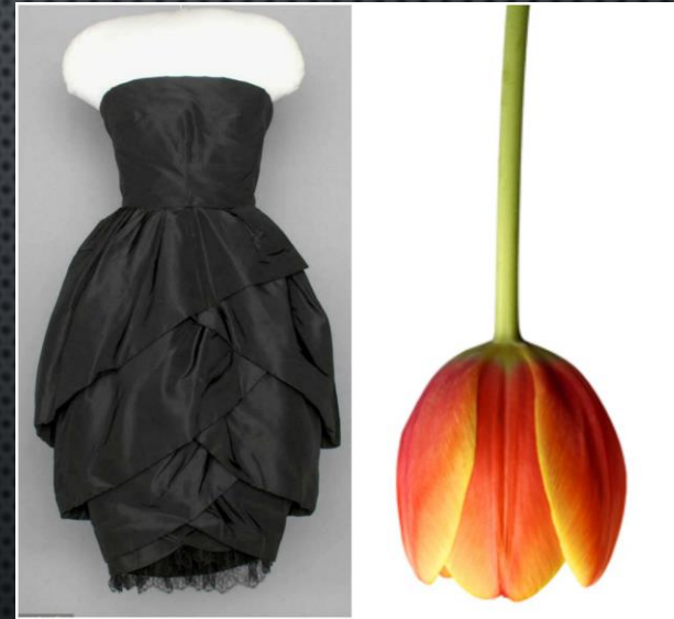
Christian Dior Black Tulip Dress, in Spring 1953 condenastprojectblog.wordpress.com