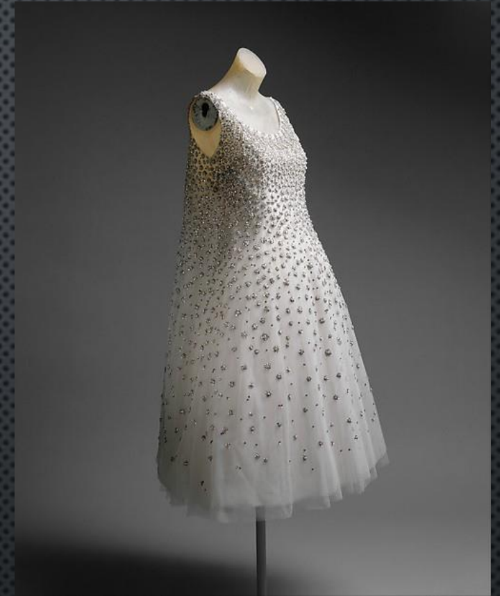
"L'Eléphant Blanc" made with silk, metallic thread, glass, plastic By Yves Saint Laurent In 1958

Accession number: 1977.329.5a, b At the MET museum