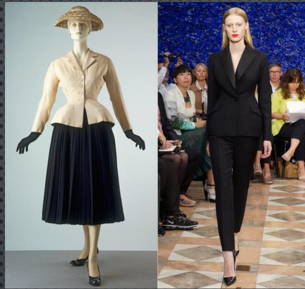
Autumn/Winter 2012 Collection sleek-mag.com/2016/07/11/dior-raf-simons-maria-grazia-chiuri/

-Modern and minimalism; The Bar Jacket, Dress-like Top, Dressed-Up Pants, made pockets in skirts and dresses