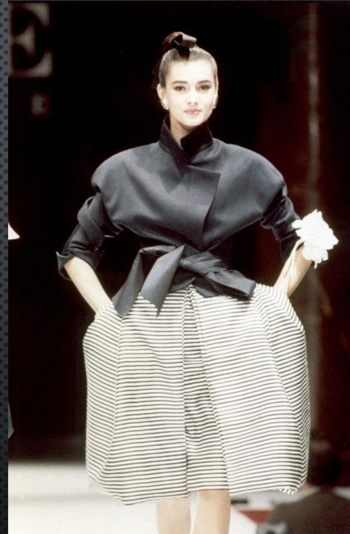
Spring/Summer 1987 collection