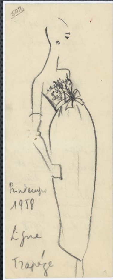
Trapeze line In Yves Saint Laurent's first collection in Christian Dior

museeyslparis.com/en/biography/premiere-collection-premier-succes