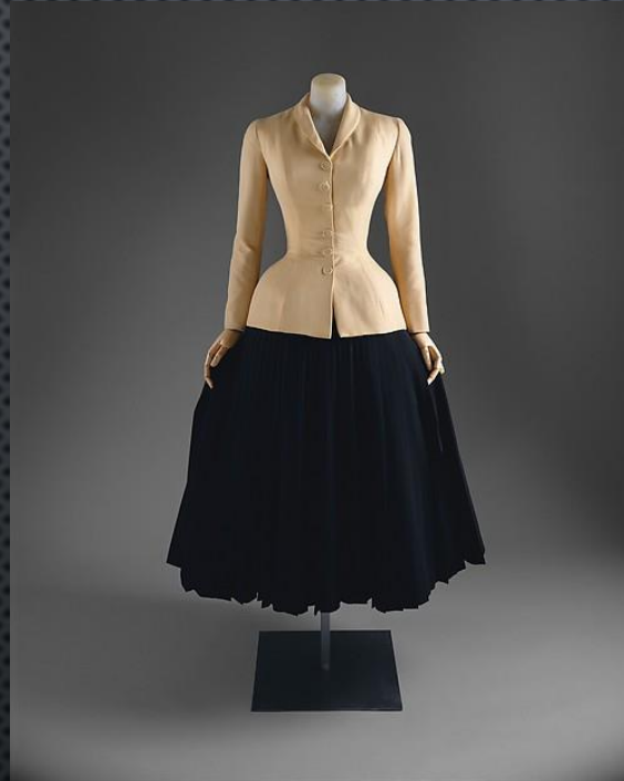
The "Bar" suit made with silk by Christian Dior in 1947 Accession number: C.I.58.34.30 At the MET museum