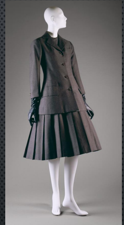
"Ensemble" made with (a-c) wool, silk and (d) straw by Christian Dior in 1955 Accession number: C.I.55.63a-d At the MET museum