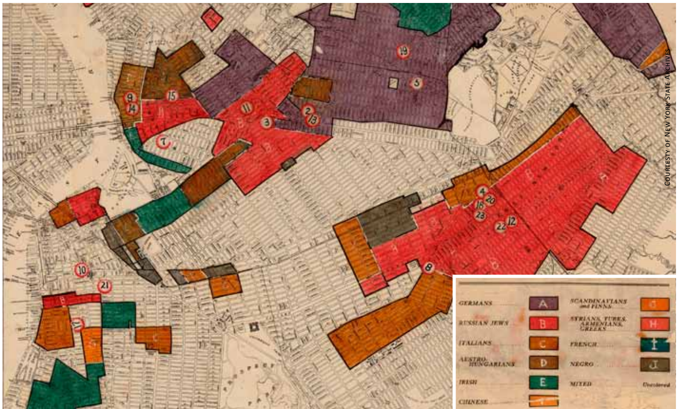
A history of NYPD mapping: In 1919, the NYPD and State Police created “ethnic maps” of New York City, identifying neighborhoods in which certain immigrants groups and their offspring predominated, with the aim to investigate socialists, communists or anarchists.

BOSS notoriously focused its investigations on dissident groups and individuals, including the NAACP, the American Civil Liberties Union, the Fifth Avenue Peace Parade Committee, and the Lower East Side Mobilization for Peace Action, compiling detailed profiles of organizations and individuals. BOSS informers and undercover agents were required to submit detailed reports including specific information on “future plans, unlawful activities, trouble makers, leaflets, weapons, speakers, and statements.” 11