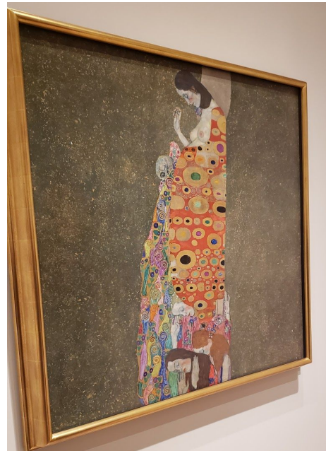
Figure 1: Gustav Klimt

image of a pregnant woman covered with different colors and shapes. By the women belly their this skull that represent danger and at the bottom of it has three women praying for the child's fate (Klimt, G. 2019). At first when I saw it, I thought it was a dress but once I took the time to observe it, the details told a great story.