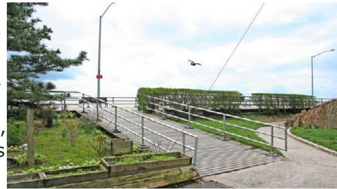
Rockaway Boardwalk in Queens, NY

Beaches are open in NYC for the summer of 2020. Beginning July 1, 2020, the beaches will be open for swimmers while lifeguards are on duty. Due to COVID-19, gatherings, barbecuing, grilling, and organized sports are prohibited. In addition, drinking fountains are closed. Boardwalks will be opened to the public during park hours. Other activities include walking, exercising, and running. There are also service changes for visitors which include: limited length of hours inside the park; social distancing; wearing face masks; food-to-go, and ordering food online. According to nycparks.org , there will also be space parking distance rules for patrons in municipal parking lots. Restrooms in playgrounds are also closed, but restrooms in city parks remain open during park hours.