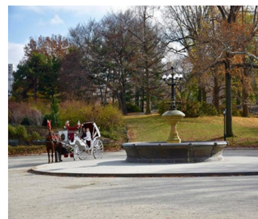
Cherry Hill in Central Park, NY