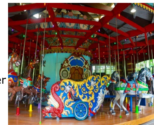
Carousel in Central Park, NY, centralparknyc.org

To book event, please visit https://www.centralpark.com/private-events/romantic-picnic-for-two/