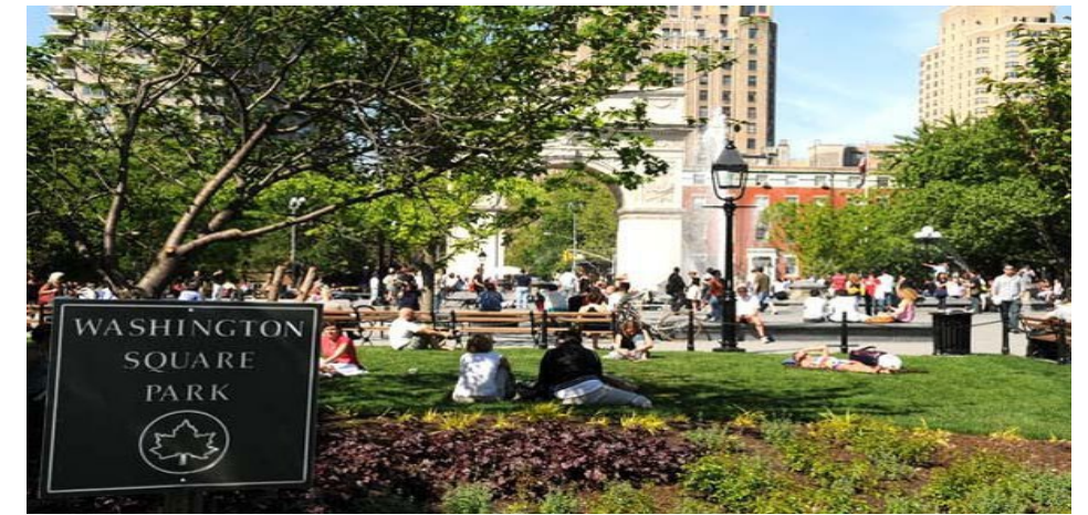
Washington Square Park, greenwichvillage.nyc

Link to Register: https://us02web.zoom.us/webinar/register/WN_qlpA70npR-tOHQjUeO85wEg