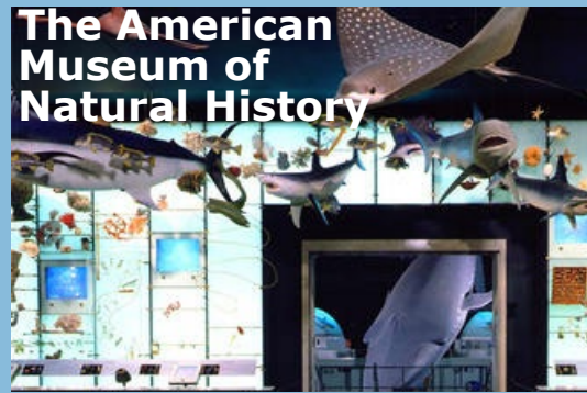
Hall of Biodiversity, amnh.org

Website: https://www.amnh.org/plan-your-visit/self-guided-tours/highlights