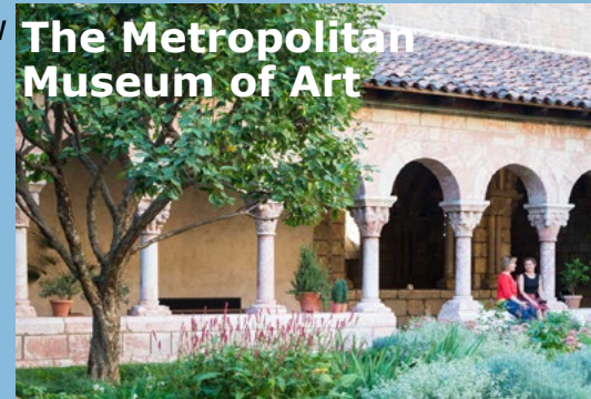
The Met Cloisters, metmuseum.org

The Metropolitan Museum of Art has three locations in New York City: The Met Fifth Avenue at 1000 Fifth Avenue; The Met Breuer at 95 Madison Avenue; and The Met Cloisters at 99 Margaret Corbin Drive at Fort Tryon Park. For the 2020 summer season, The Met is now offering free virtual events for viewers in a wide range of topics relating to art history, educational workshops for all ages, and virtual tours that showcase the museum's historic architectural designs and landscapes. Virtual Events you can expect to see are: Met Live Arts , Artists on Artwork , Met Memory Cade , Virtual Camp on YouTube , Thapaleo Masita at The Met Cloisters , and The Met 360 Project .