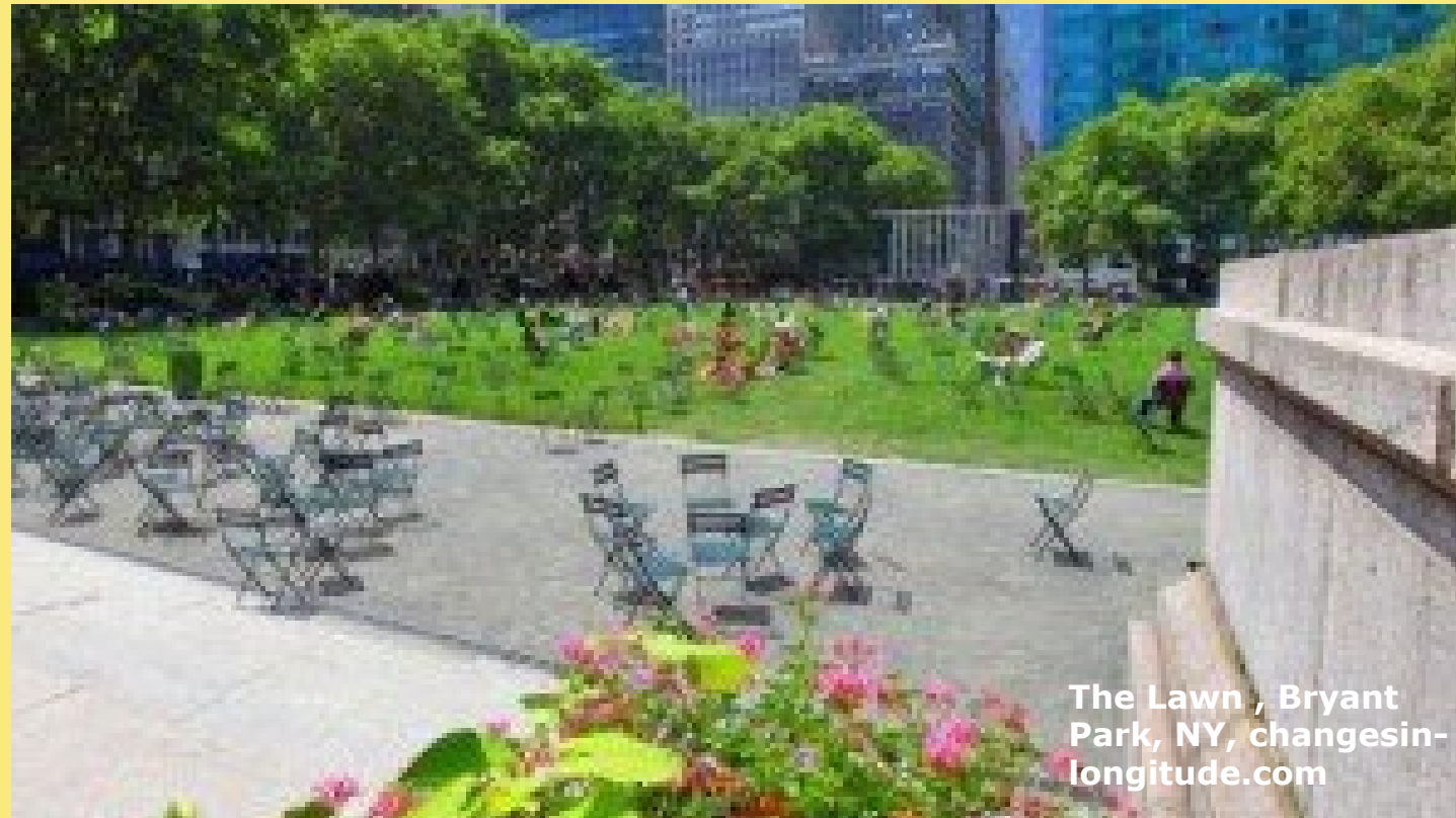
The Lawn , Bryant Park, NY, changesin-longitude.com