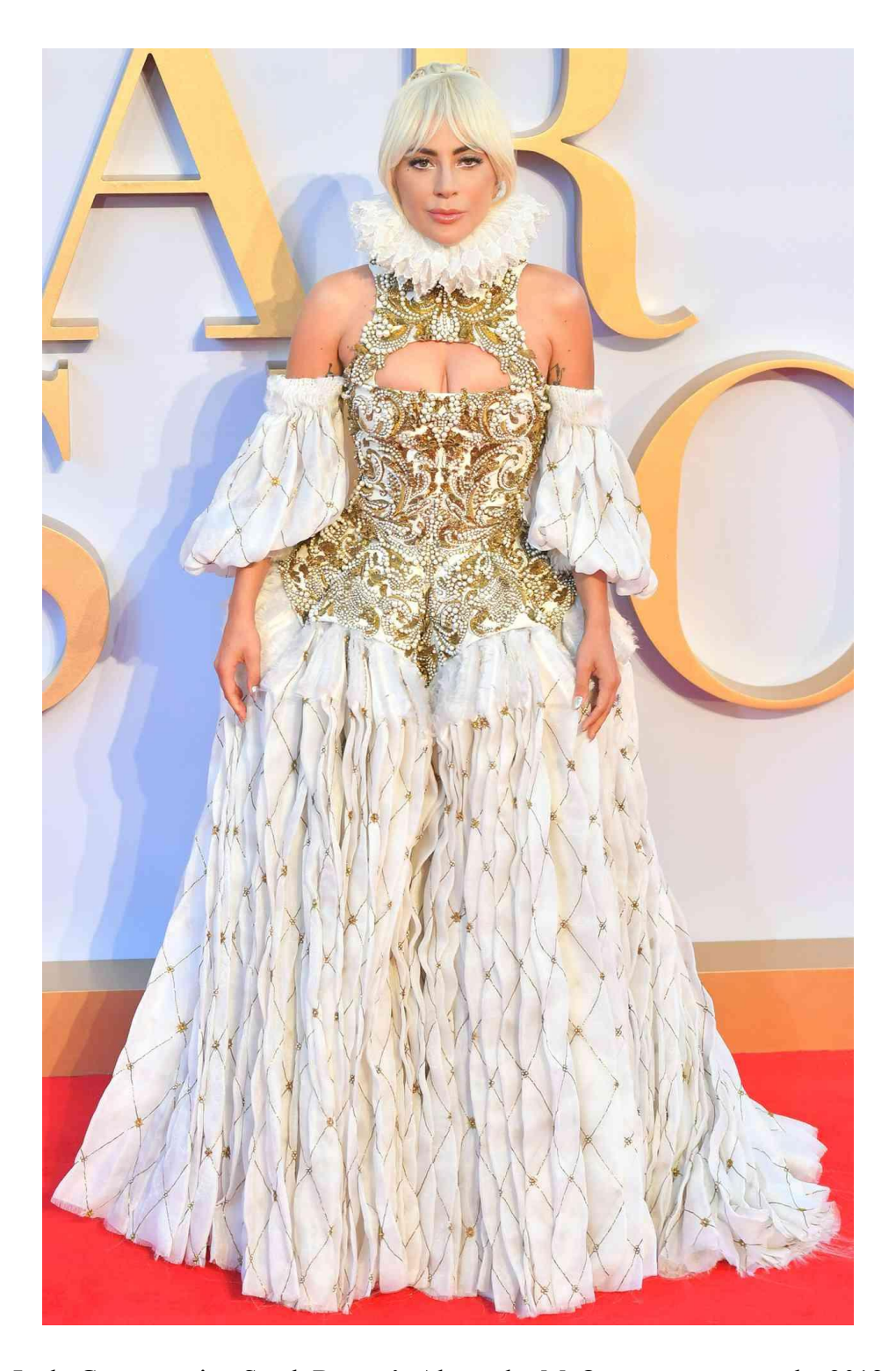
Figure 4. Lady Gaga wearing Sarah Burton's Alexander McQueen garment to the 2018 premiere of A Star is Born that took place in London