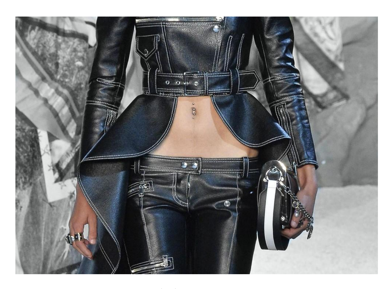
Figure 1. Low leather trousers at McQueen SS19