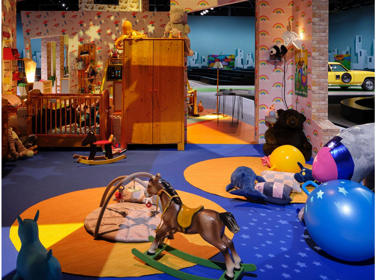
Figure 3. Room full of kids entertainment