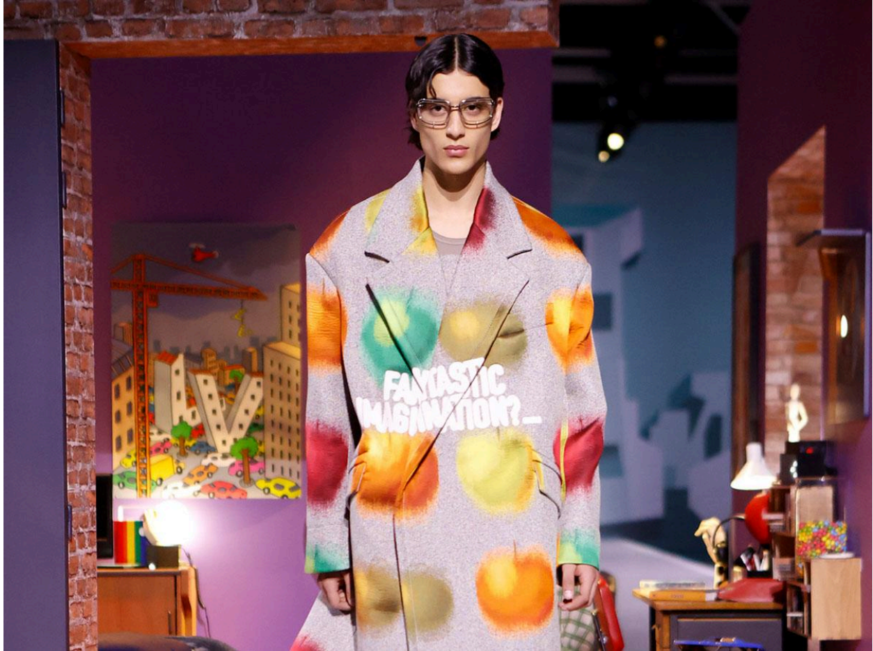
Figure 4. Model wearing trench coat for Louis Vuitton Fall/Winter 2023