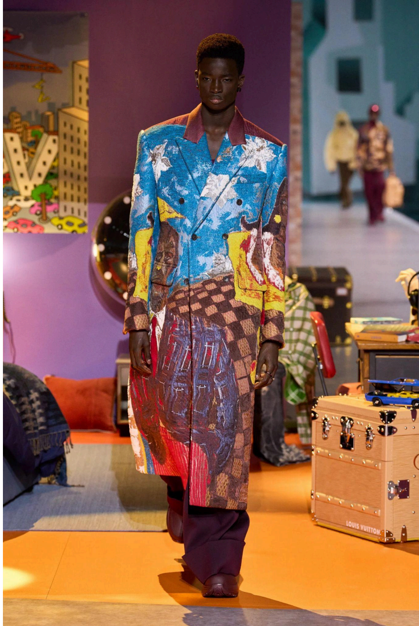
Figure 5. Model walking with vibrant garment for Louis Vuitton Fall/Winter 2023 Collection