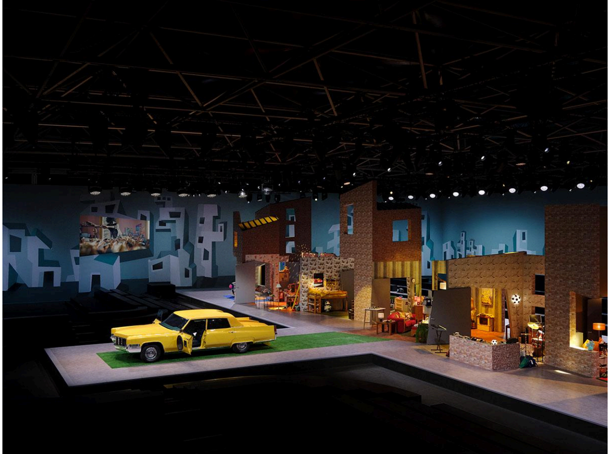
Figure 2. A side view of the Louis Vuitton fashion show runway