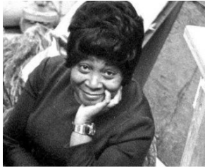
Zelda Wynn Valdes