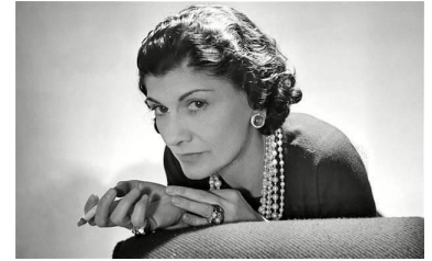
Gabrielle Bonheur Chanel