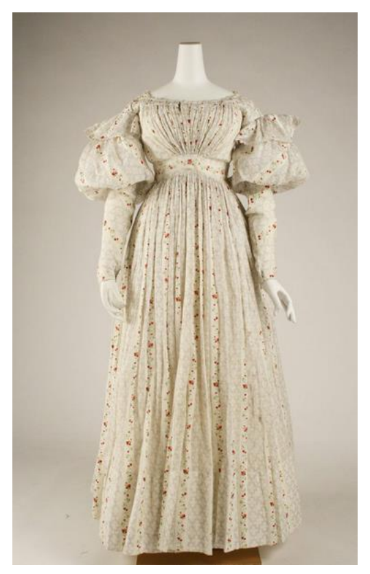
Figure I. 1827 Morning Gown

One wears clothing for many reasons, but it protects the body overall. The dress has become a huge staple in the fashion industry. The way that is had transformed over the years explains the past, present, and future. Such as the day dress, which has come a long away. In the 1820s, the day dress is not what anyone would wear right now. The day dress came about in the early 1800s and has changed a lot since then. In the early 1820s, the day dress had a ruffled neck (Franklin, 2020). The waist was lowered, and the sleeves were fuller (Mimi Matthews, 2015). Changes occurred more into the late 1820s, these dresses, were