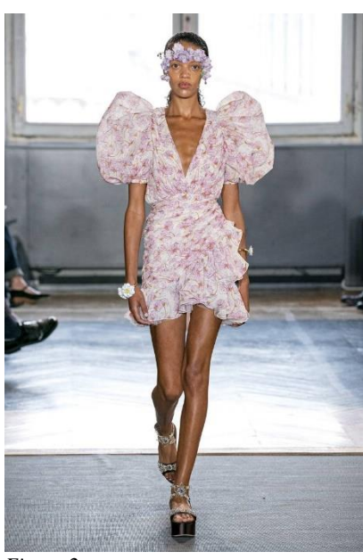
Figure 2. https://www.whowhatwear.com/springdress-trends-2020/slide17

The day dress has come a long way from its origins. The modern-day dress is less structured and fitted. The modern dress pays homage to the past with the chosen patterns of the dresses. In Spring 2020, there has been a resurgence of puff statement sleeves in day dresses playing on the Victorian style dress (figure 2). As stated earlier, the day dress had a reemergence in the 1920's. The 1920's was known as the roaring 20's. The hemlines were getting shorter and the young people were out partying secretly. This time was also the birth of the new woman how broke out of the social norms. She was