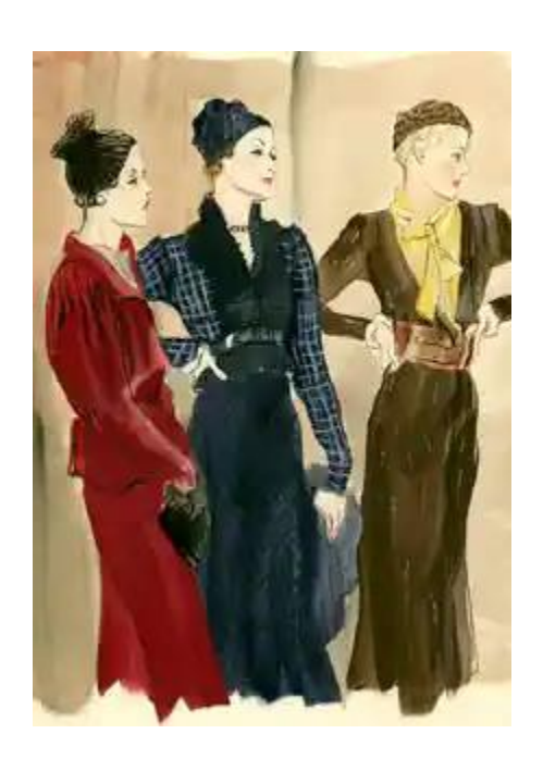
Figure. I. Vogue Illustration of three women in Schiaparelli suits.

For example, for spring it can change to more bright colors. Fabrics to be displayed for the spring will be crochet and vintage-inspired denim fabrics. Satin fabric will be used for special occasions. The Color for 2020 is classic blue. For 2021 are aqua and yellow. The concentration will be on more saturated, blue and bold colors for 2021. Also, a combination of the classic blue and several colors such as mauve, vermilion red, medium grey, tobacco brown, and blush will be on trend for 2021.