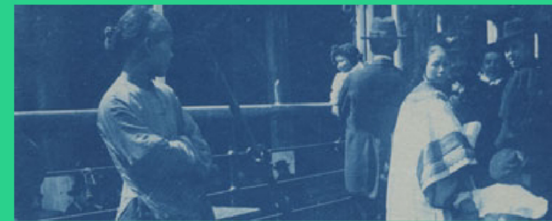
With a Single Step: Stories in the Making of America Tue, Sep 1, 2009 - Sun, Dec 31, 2023

With a Single Step: Stories in the Making of America, MOCA's new core exhibit, will bring to life the Museum's unique historical content and birth a compelling art work by fusing itself with the architectural heart of its new home designed by Maya Lin on Centre Street. This presentation is an innovative approach to museum and exhibition design. It will facilitate a new way of interacting with content: through the evocative use of space that stirs visitors' emotions and breaks down barriers to deeper learning and understanding.