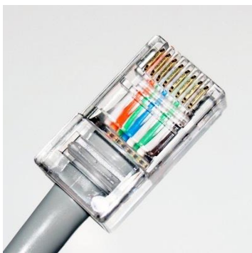
Image three show the Ethernet cable properly installed into the connector (If you look at your land line phone or internet wires you will see something similar to image three.)