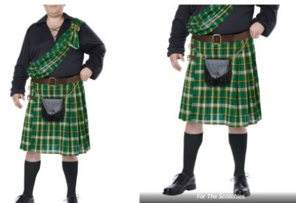
For The Scots