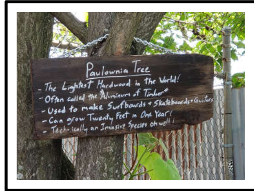
Paulownia Tree – Tree of life growing on the walls on of the canal.