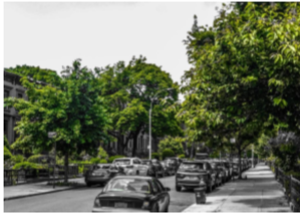
Spaces for Garden