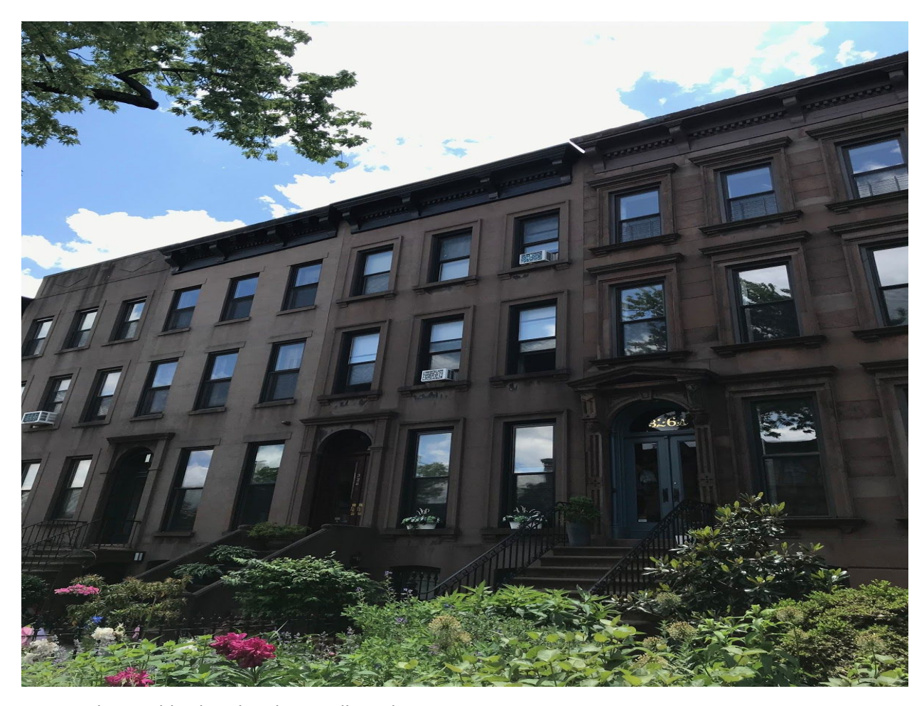
The neighborhood in the Caroll Garden

1. What are some general observations about the character of this neighborhood? What does it remind you of? How does it make you feel?