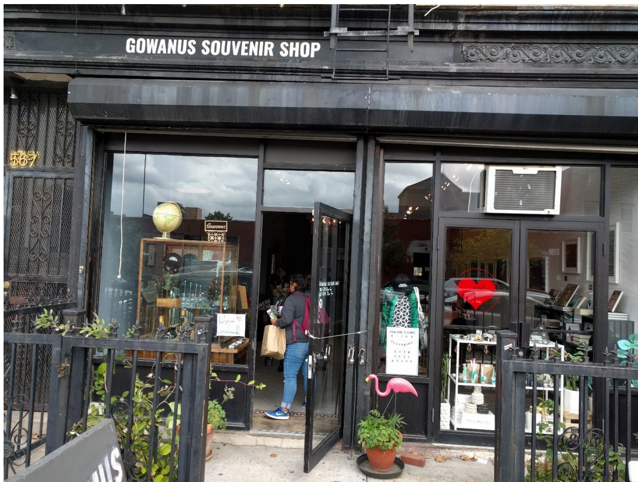
2567 Union Street, Brooklyn NY 11215 -GOWANUS SOUVENIR SHOP