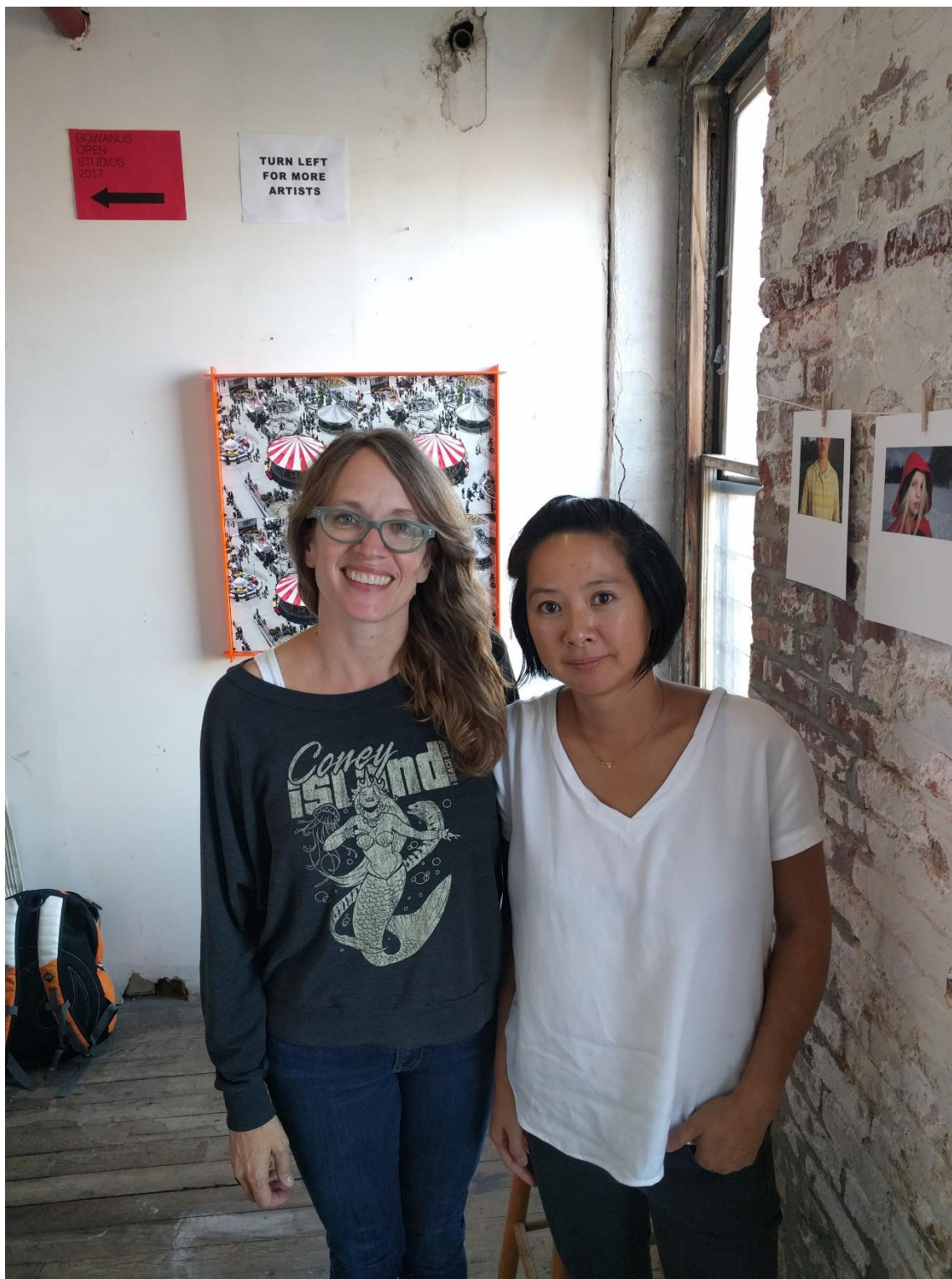
Visiting artist from Park Slope.